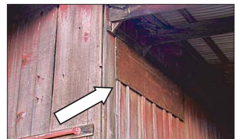
Simple bat habitat: A sheet of 1/4" plywood on board-and-batten barn siding.

Spiders often kill more insects than they can consume, but each species of spider has its own food and habitat preferences. To attract a wide range of spiders that will prey on many different kinds of pests, farmers can plant hedgerows in or adjacent to fields. It's a good idea to include perennial and annual plants of different heights, as well as groundcovers and mulches. For more information: rexd@ncat.org