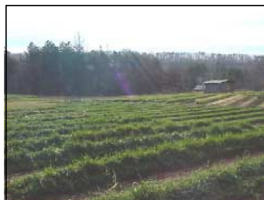
Cover crops, Shinbone Valley, TN (photo printed with permission)

When erosion by water and wind occurs at a rate of 7.6 tons/acre/year it costs $40 per year to replace the lost nutrients as fertilizer and around