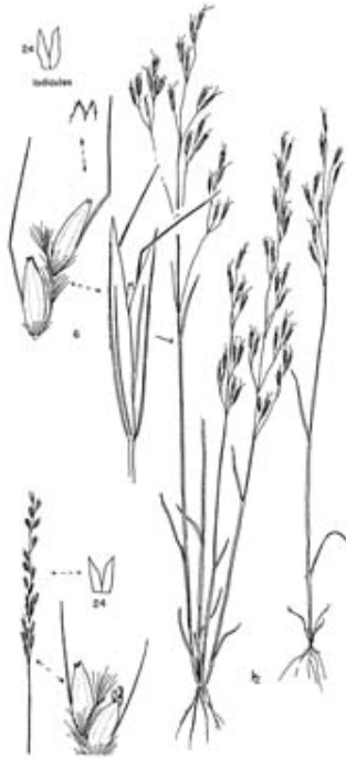
Line drawing reprinted with permission, University of Washington Press

clay soils and silt loams above a shallow, impervious layer. However, it also grows on coarse textured substrates that stay moist through seed development. Annual hairgrass apparently tolerates some salinity and prefers full sun. Fall germinants actively grow all winter, tolerating several days to several weeks of continual submergence.