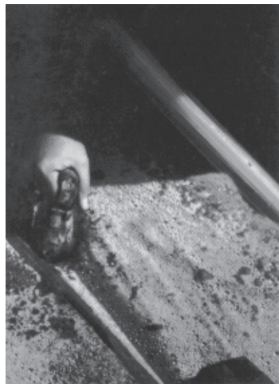
Figure 4. Holes being made in row cover system using a bulb planter. The black tube centered under the plastic is a drip irrigation hose. In these pictures only one hose is used, but with 3 rows of strawberries it is desirable to have two lines spaced between the 3 strawberry rows for more even irrigation. Note the sides rolled down to facilitate planting.

When the plants begin to flower vigorously, it is necessary to lower the row cover (Figure 5) so that bees and other insects can pollinate the flowers. If the sides are left up a few inches, some protection is provided from the wind and a slightly warmer microclimate is obtained. Removing runner plants throughout the growing season is not necessary.