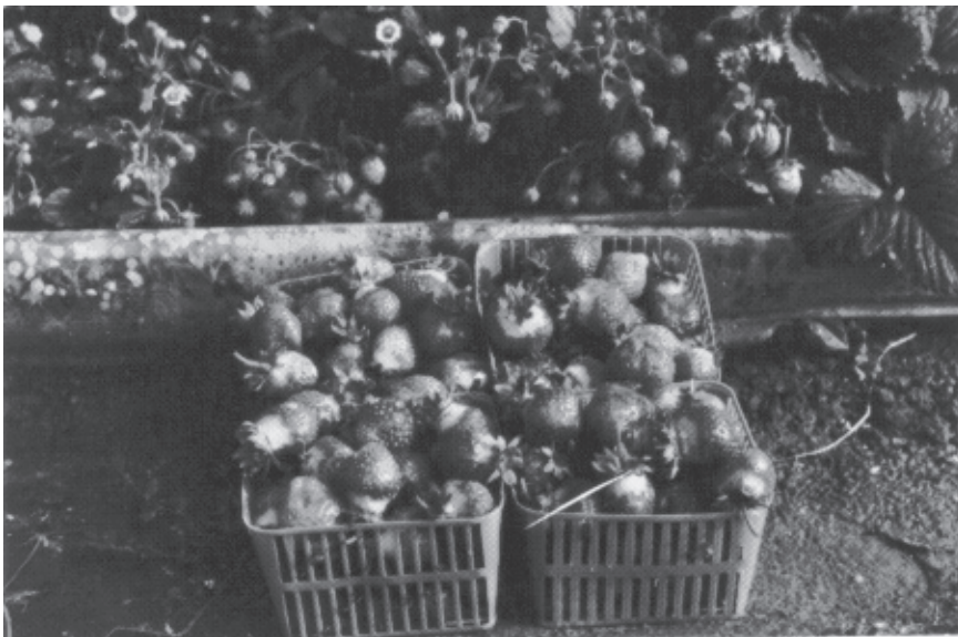
Figure 1. Quinault strawberries produced by the row-cover system. Heavy fruit load on the plants is seen at the top of the picture.

Yields were based on a bed size of 30 inches by 10 feet containing 30 plants. About 8,712 linear feet of these beds could be grown in an acre.