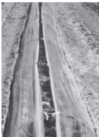
Figure 3. Row covers over strawberries showing raised sides with a small opening left to prevent excessive heat buildup. Sides should be left up until flowering, when a larger opening will be necessary for good insect pollination.