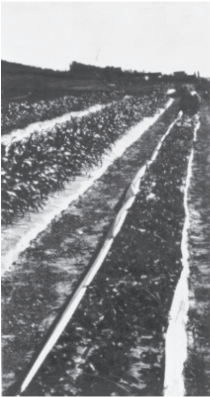
Figure 5. Strawberry beds with sides of row covers partially down so that bees and other insects can pollinate flowers.

rows are level. It is important to keep the soil moist in order to obtain larger plant size and the highest yield. During warm weather, it is necessary to irrigate about once per week.