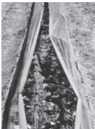
Figure 2. Young strawberry plants growing in row covers. Row covers are partially open to show 12-gauge-wire hoops, clothespin attachments and spacing of plants.

Transplanted strawberries are placed 3 rows per bed in a diagonal arrangement so that about 30 plants can be placed in a 10-foot length. Each plant occupies about 1 square foot of space. Plant spacings greater than 1-foot per plant have resulted in decreased yields per