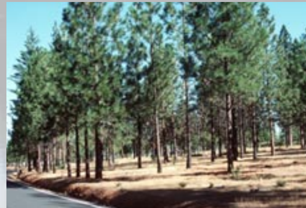
We are committed to maintaining healthy, sustainable forests.

We have the primary responsibility for monitoring forest pests and providing financial and technical assistance for reducing pest-caused damages. We provide unique technical expertise in this area.