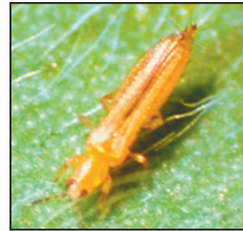
ADULT WESTERN FLOWER THRIPS

Thrips feed by piercing plant cells with their mouthparts and sucking out the cellular contents.