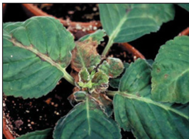
TOMATO SPOTTED WILT VIRUS ON GLOXINIA

There are two different but closely related viruses causing greenhouse crop symptoms, both with a very wide host range. TSWV and INSV are transmitted from plant to plant primarily by western flower thrips (there are several other species of thrips which can also transmit these viruses). Thrips acquire the virus as larvae and only transmit during the adult stage.