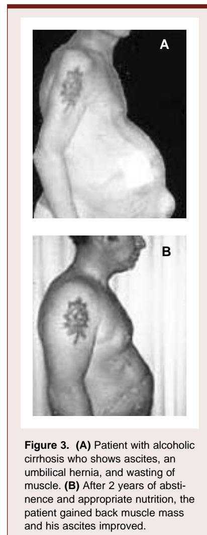
Figure 3. (A) Patient with alcoholic cirrhosis who shows ascites, an umbilical hernia, and wasting of muscle. (B) After 2 years of abstinence and appropriate nutrition, the patient gained back muscle mass and his ascites improved.

Patients with SBP may not have symptoms, or manifestations of the infection may appear to be unrelated to