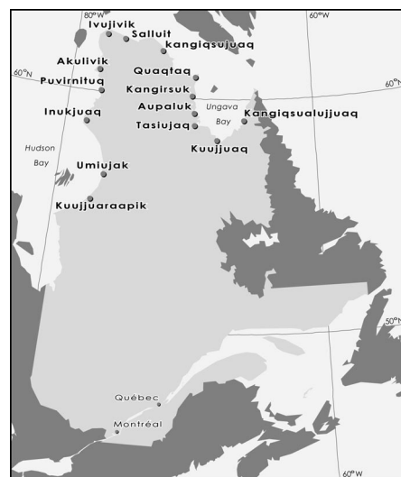
Figure 1. Geographic location of Nunavik, Québec, Canada.

Statistical analysis. We assigned a value of half the detection limit of the analytic method when a compound was not detected in a sample. In all statistical analysis, we considered only those substances for which 50% of the samples were above the limit of detection. This was done because trends calculated from a majority of samples with imprecise values (below the limit of detection) would most likely yield biased results. Contaminant concentration variables had log-normal distributions and were log-transformed for all analyses.