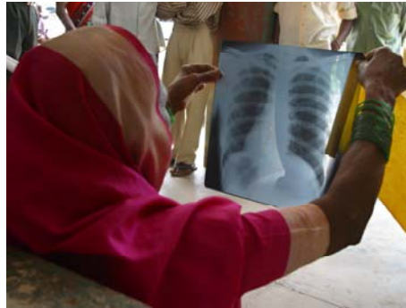
An Indian TB patient looks at her chest x-ray.

In the absence of preventive TB vaccines, the United Nations AIDS Program and WHO, as well as the Centers for Disease Control and Prevention guidelines, currently recommend IPT for HIV infected adults with latent TB. Targeted IPT has been shown to reduce the risk of active TB by up to 60 percent both in regions where TB is endemic and in regions where it is not endemic.