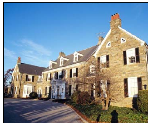
Fogarty's historic "Stone House," will be the site of several events during the Health Security Initiative Ministerial Summit.

Formed after Sept. 11, 2001, the Global Health Security Initiative is an informal