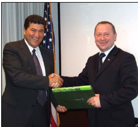
NIH Director Dr. Zerhouni and Lithuanian Health Minister Turcinskas met recently to discuss Lithuanian health reform and areas of potential research collaboration.

Lithuanian life expectancy, especially for men, is exceptionally low by EU standards. There are high incidents of cardiovascular disease, cancer and TB, as well as accidents and suicides, especially for men in rural areas. Alcohol abuse is a significant contributory factor to both accidents and suicides.