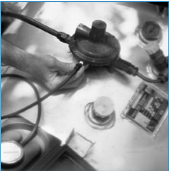
Propane technician performing a leak test.