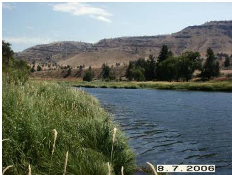
Figure 3. Wide, slow-flowing section of the upper river where both banks are completely covered by a combination of torrent sedge at the lowest level and reed canarygrass higher on the banks. This is a repeating pattern in this type environment throughout the river.

Using the PFC assessment process of identifying potential and capability, and thinking through each checklist item on each reach has led to a better understanding of the potential, current condition and trend. It has also allowed us to establish, with a high degree of certainty that the John Day River is improving. Maybe not the way we thought it would or with the plants we currently desire, but it is getting better, it will just take a long time.