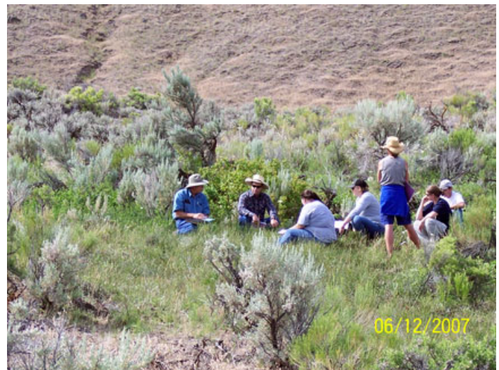
ID Team discusses the lentic PFC assessment on a spring fed wetland.