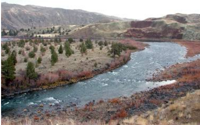
Figure 2. The red stems of coyote willow clearly show the extent of colonization of rocky banks below Clarno Rapids. This photo was taken in early December 2006, with river flows about 400 cubic feet per second. A few days later, nearly all the willows were inundated and remained so until June 2007.

The brunt of the recovery is being carried by these few species with other willows, sedges, rushes, and bulrush filling in where smaller sites can accommodate them. The current flow conditions and substrate variety requires this flexibility in species composition. In this recovery, plants are needed that can stay totally submerged for up to 6-8 months like torrent sedge and threesquare bulrush, to plants that can be wet and then dry for several months but still have root masses that can withstand high flows such as coyote willow (see figure 2). The John Day River is dictating the conditions needed to recover and the group of plants that meet those requirements are the ones present today, facilitating the evolution from its current state and moving it toward the higher identified potential. Some of these species are ones we don't particularly relish like reed canarygrass, but at this point in recovery it is doing the job and we feel that through succession it may have a reduced extent (see figure 3).