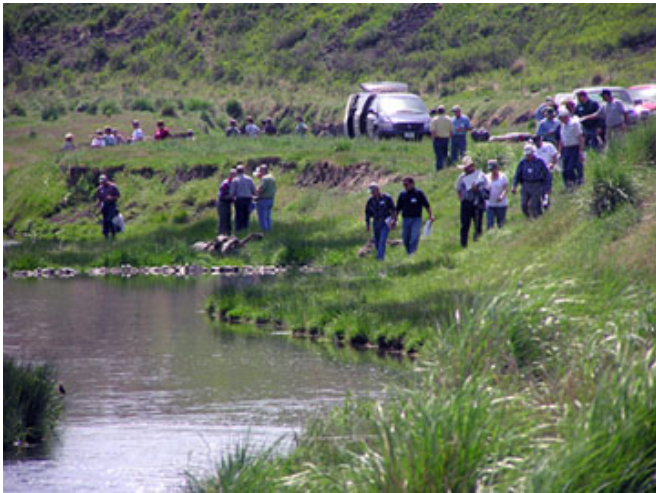
ID teams discussing the attributes and processes of the riparian area.

"It was a worthwhile expenditure of time, effort, and money. I learned a lot, and think most other people learned a lot too."