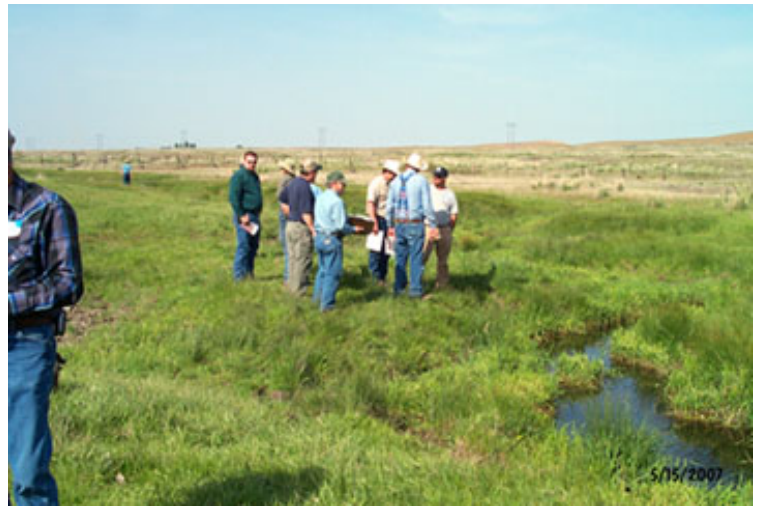
One of the teams evaluating a riparian area grazed in late winter and spring.

The National Riparian Service Team can be contacted at: