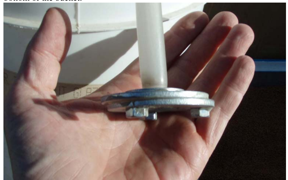
The intake end of the tube has been heated and fared to secure it into the weight

As in all things it is the details that make the difference. Starting at the top of the system, the siphon tube intake is weighted down using washers and nuts that have been epoxied together. The weight is designed to hold the intake of the tube parallel and near to the bottom of the bucket.