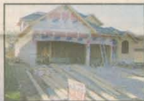
The housing sector continues to be a strong part of the diverse economy in the Ozarks. Homeownership is at an all time high and construction projects are strong job creators.

Legislation passed by Congress has aided economic growth and job creation by reducing regulatory barriers, limiting abusive lawsuits, creating job training opportunities, and keeping taxes low. Money spent by business owners and entrepreneurs on regulatory compliance, defending against frivolous lawsuits and paying taxes is money that is not available to them to expand their business and create new jobs. In addition to these other job creating efforts, the Congress has enacted an energy bill that will create new technologies and open new opportunities to produce ethanol and other renewable sources of power. Finally, the highway construction measure will create thousands of new jobs as billions of dollars are spent building new and better roads. In Southwest Missouri the highway measure will mean good paying jobs and lives saved on improved roadways that provide a more efficient commerce delivery system.