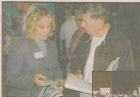
More than 4,800 people attended two Medicare Insurance Fairs in Springfield and Joplin to get information from more than a dozen companies.