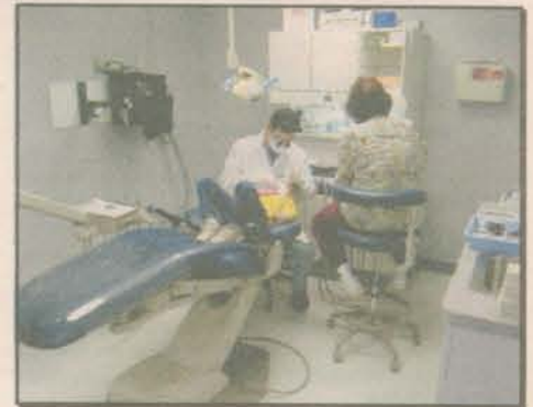
A dentist at the Jordan Valley Dental Center works on a four-year-old patient in one of the new treatment rooms for which Congressman Blunt and Senator Bond secured federal funding.

The remaining money will be used to upgrade equipment in MSSU's growing field of environmental health and bioinformatics. Missouri Southern State University has one of only 25 accredited environmental health programs in the nation.