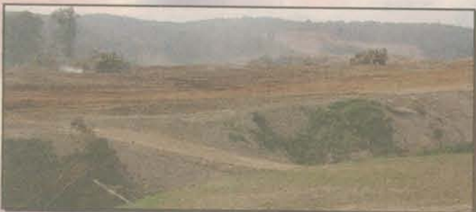
The final contract to four-lane Highway 71 to the Arkansas line in McDonald County was awarded in late summer. Motorists could be on a dual-lane, divided highway in 2007.