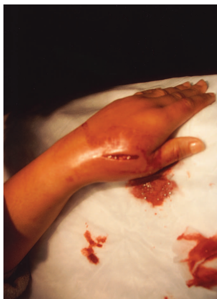
Figure 2. Incision site of V.V.'s hand before irrigation.