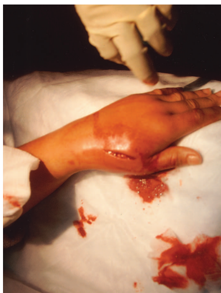
Figure 1. Incision made in hand of V.V. shows mercury pellets inside the incision and the inflammation of the injection site.

Intra-arterial injection can cause digital ischemia and/or gangrene secondary to embolization. One case of cardiac granuloma secondary to intra-arterial injection has been reported (Kedziora and Duflo 1995). When mercury is injected intravenously, it goes mainly to the lungs and can cross over to systemic circulation (Givica-Perez et al. 2001).