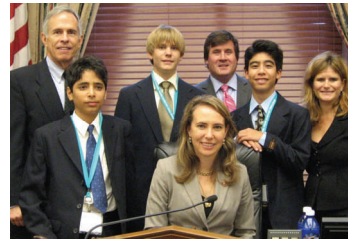
Chairman Gordon and Rep. Giffords with students from Discovery Channel Young Scientist Challenge