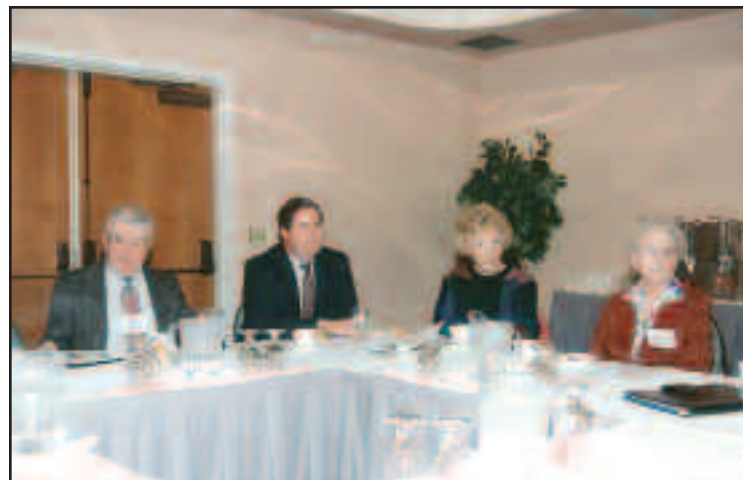
REP. CALVERT meets with AARP members to discuss Senior's issues.