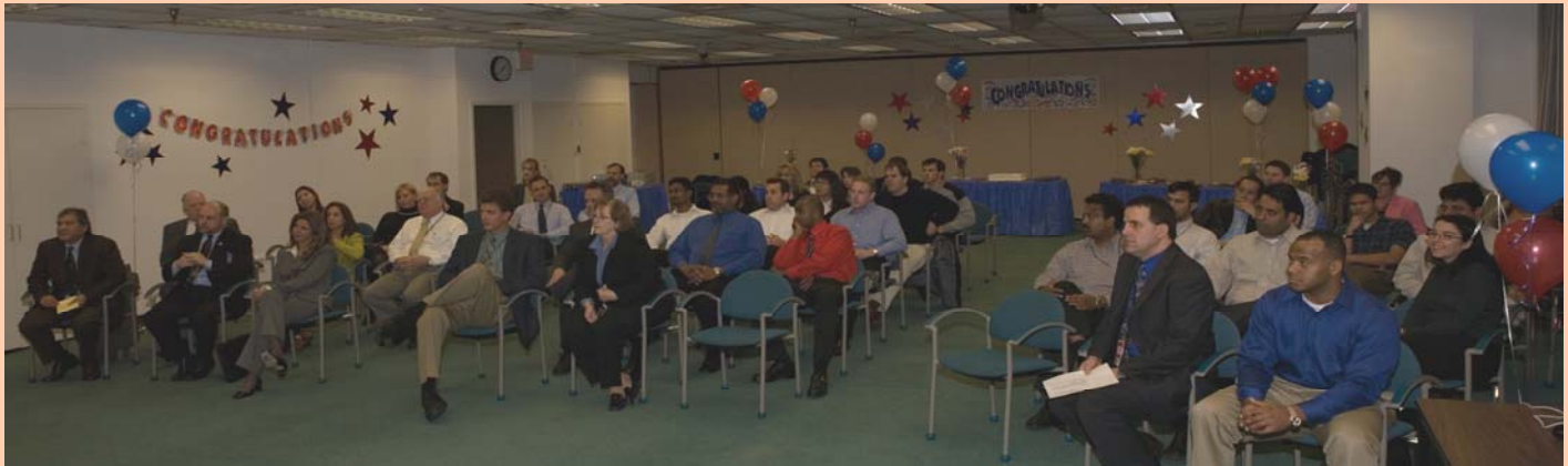
The UFMS-PSC project team listening to opening remarks at the CRP2 Recognition Ceremony.