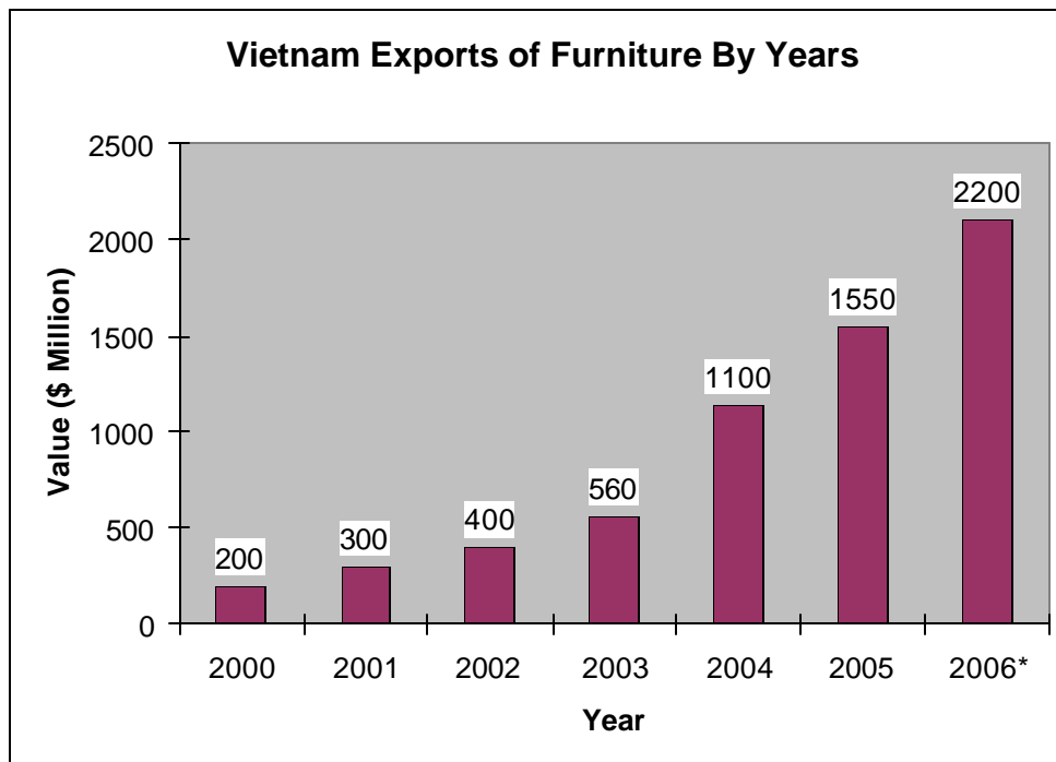
Chart 1: Vietnam’s wooden furniture exports by years

Vietnam-made wooden furniture is now available in 120 countries and territories, but the United States, Japan and the European Union remain the three largest importers. Table 2 shows the top ten countries for the import of Vietnam’s wooden furniture. Together, these countries accounted for over 87% of Vietnam’s total furniture exports in 2005.