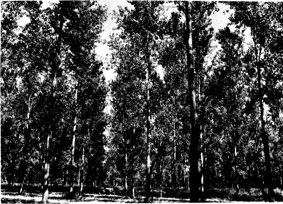
Figure 1. — Cottonwood planted at 40-by 40-foot spacing in July of the 11 th year (the tractor is mowing a dense johnson grass ground cover that still develops because of open stand conditions).

in the 6th year, and during the first week of May in the 7th and 8th years. From the 2nd through 5th growing seasons, trees were examined monthly and any sprouts were removed. After the 5th year, epicormic branches were removed only at time of pruning.