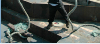
A crewmember heaves a mooring line to the pier at the New Orleans Port Authority Saturday, Aug. 9, 2008, as the first half of salvage operations to remove the barge DM 932 near completion.