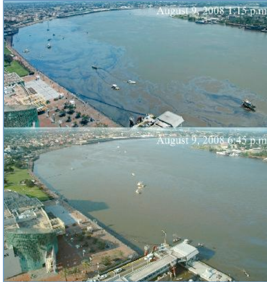
In this photo illustration by the U.S. Coast Guard, oil spill cleanup progress can be seen after additional release of oil during salvage operations on the barge DM 932 on the Mississippi River at New Orleans Saturday, Aug. 9, 2008. The skimmer vessels and other work boats were pre-positioned downriver from the salvage operations to make cleanup easier after the expected oil spill.