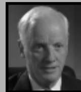
Frank Keating OK City Bombing