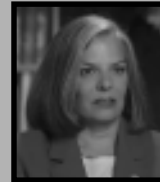
Julie Gerberding SARS