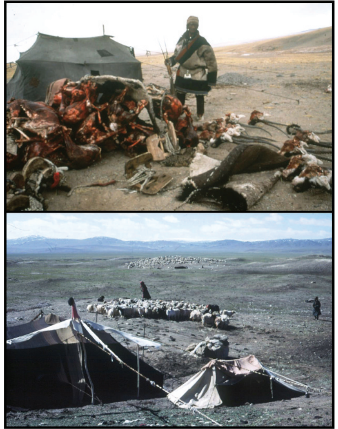
Fig. 7. —Poacher's camp with a pile of carcasses and heads of Pantholops hodgsonii in Tibet, December (top), and nomad tents and herds of sheep and goats occupy traditional range of P. hodgsonii in western Tibet, July (bottom).