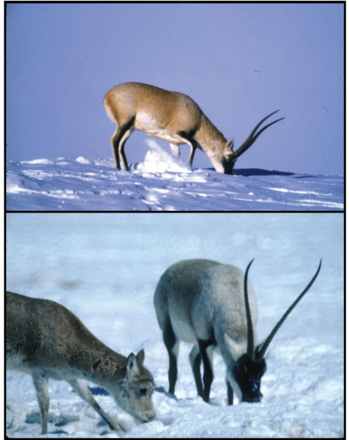
Fig. 5. —Adult male Pantholops hodgsonii pawing for scant forage (top), and adult male and female foraging in snow (bottom), Qinghai, late October.

Diets. — Pantholops hodgsonii is an herbivorous ruminant. Foraging preferences are understood mainly from limited microhistological analyses of feces (Cao et al. 2008; Harris and Miller 1995; Schaller 1998). P. hodgsonii is a mixed feeder (Cao et al. 2008), seasonally eating grasses, sedges, forbs, and select parts of dwarf woody vegetation, although dietary diversity is constrained substantially by limited forage availability and diversity on the Tibetan Plateau (Schaller 1998). In Chang Tang Nature Reserve, annual percent use of various plants is graminoids: Stipa , 3.7–47.3%; Kobresia , 1.1–33.1%; Carex moorcroftii , 0.5–22.8%; herbaceous plants: Potentilla bifurca , 0.3–31.1%, Leontopodium , 0.2–11.9%; and dwarf shrubs: Ceratoides compacta , 0.2–63.5%, Ajania fruticososa , 21.2% (Schaller 1998).