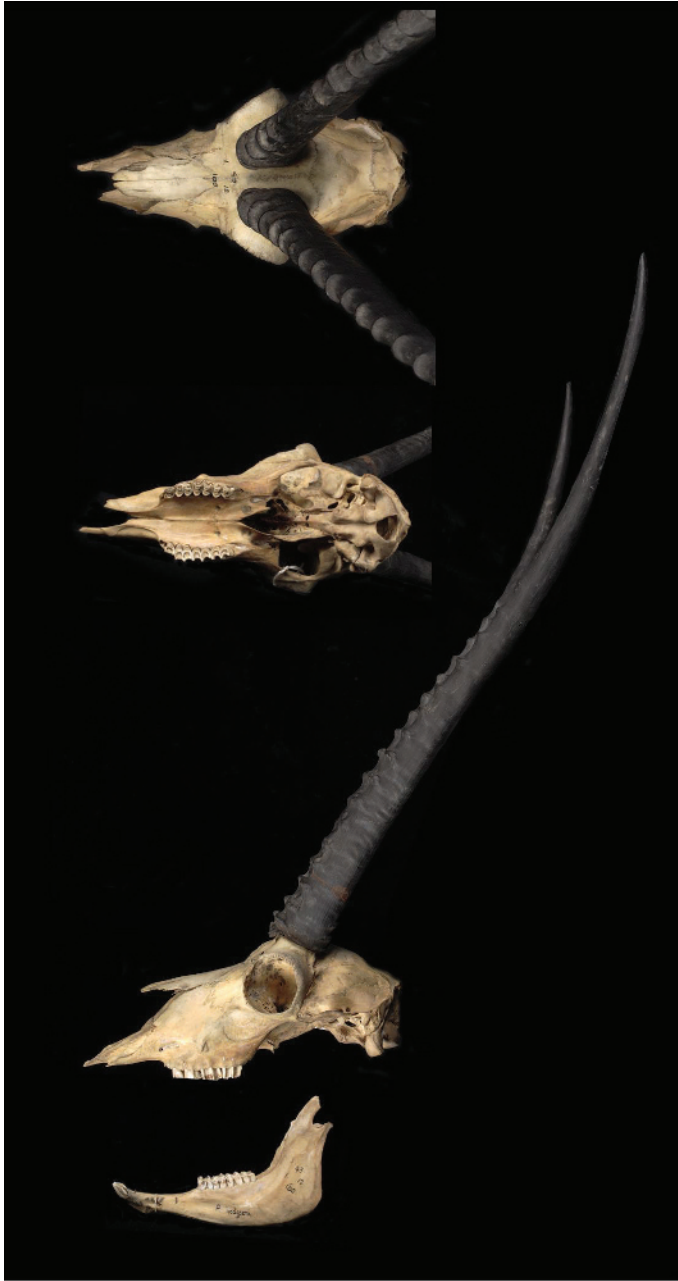
Fig. 2. —Dorsal, ventral, and lateral views of skull and lateral view of mandible of adult male Pantholops hodgsonii (British Museum [Natural History], specimen 1843.112.100). Greatest length of skull is 256 mm, but note that the tip of nasals is broken off.