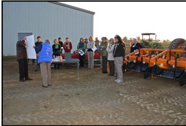
Russell Ranch Sustainable Agriculture Facility

The group spent the afternoon “getting their feet dirty” on a tour of the Russell Ranch Sustainable Agriculture Facility and the Student Farm. This provided an opportunity to learn about some of ASI’s on-the-ground programs.