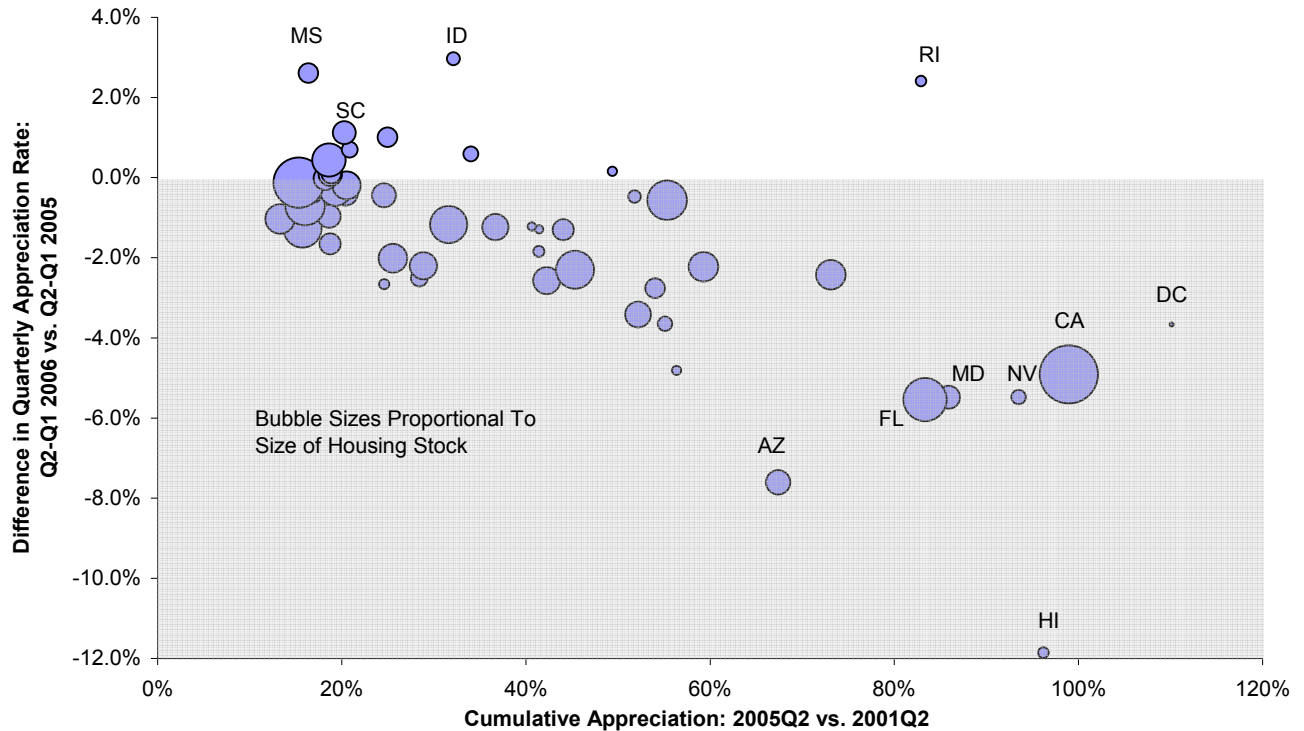
Figure 2: Recent Appreciation Rate Changes vs. Aggregate Run-Up in Prices by State

Note: Underlying indices are seasonally-adjusted and do not employ valuation data from refinance appraisals.