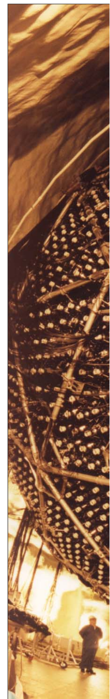
View of the Sudbury neutrino detector panels, but before c