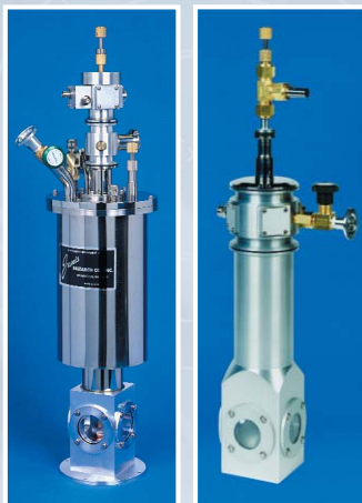
Sample in Vapor