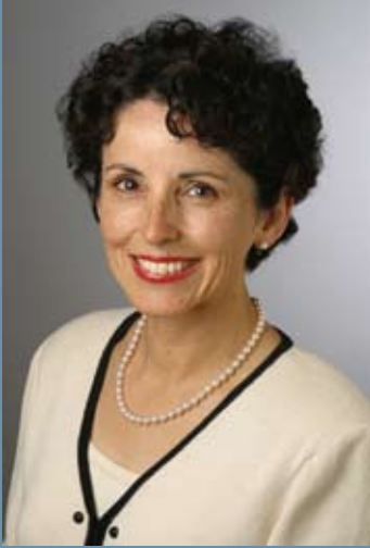
France A. Córdova

During my first year as Purdue’s president, I have been impressed by successful efforts of Purdue’s Technical Assistance Program, which have clearly been a boon to our state and its economy. TAP is remarkable in its ability to impact the businesses, institutions, and people of Indiana. It is truly a vehicle to “advance Indiana’s economic prosperity and quality of life” — and, thus, positively impacts thousands of Hoosiers from Fort Wayne to Terre Haute.