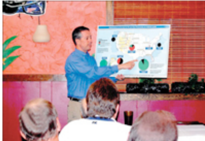
Congressman Thornberry discusses energy issues with constituents.

I want to update you on some recent efforts to require the Congress to take action on energy issues.