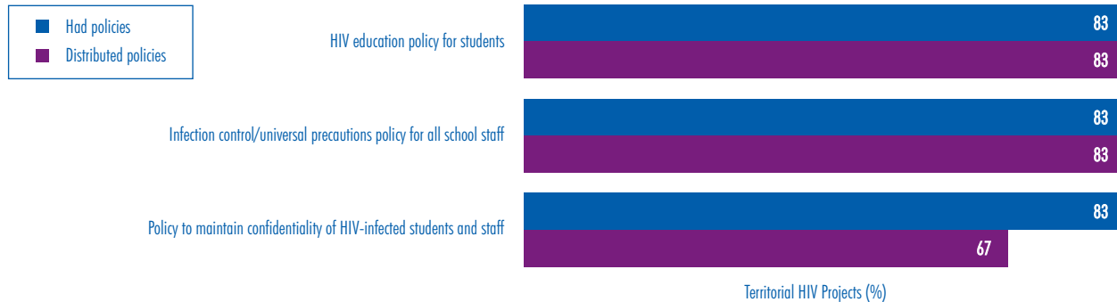
Percentage of Territorial HIV Projects That Had and Distributed Model Policies, Policy Standards, or Other Policy Materials to Districts or Schools on Each of the Following Topics