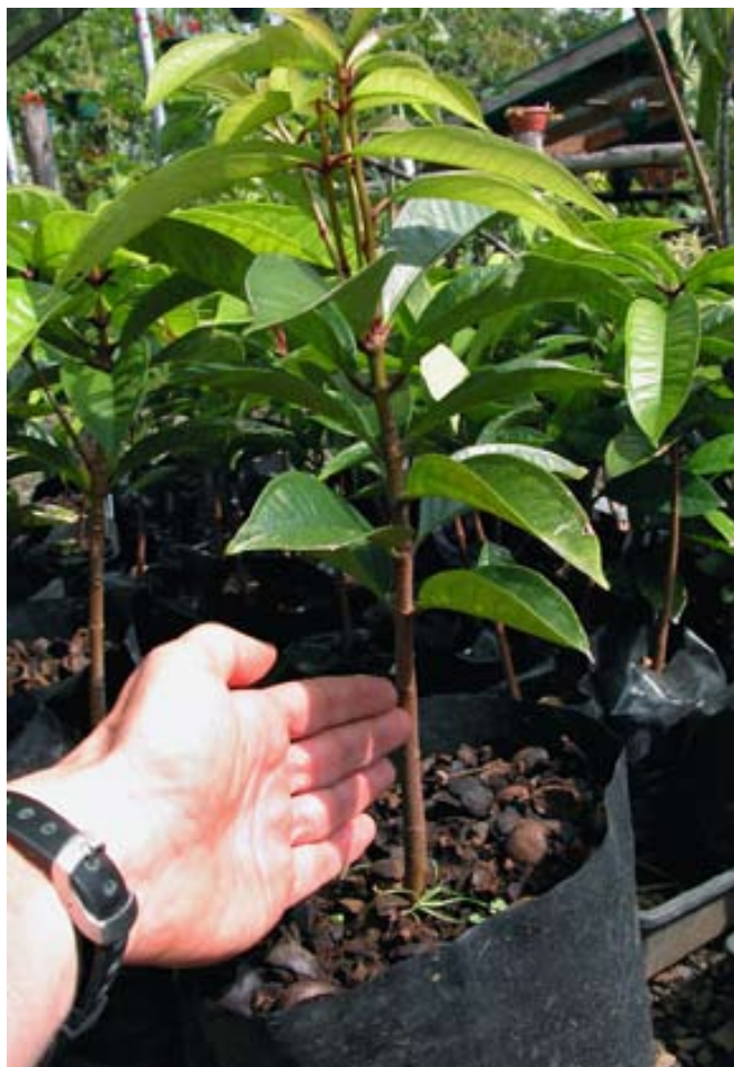
Seedling ready for outplanting.

While seed propagation is common, superior types are multiplied vegetatively. Air-layering and cuttings are both successful methods. Air-layering is best carried out on young branches 1–2 years old. A branch diameter of 1–2 cm (0.4–0.8 in) and length of 30–45 cm (12–18 in) are ideal. Pick branches that are easy to access, and preferably with stems that are shaded by other branches. Air-layering works well any time of year, but the mother plant should be in good health and have adequate water and nutrition available. Cuttings have been successfully rooted in sand in Hawai'i. Cuttings are ready for transplanting 6 weeks after rooting.