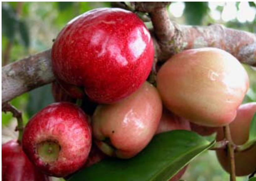
Flower buds, flowers, and ripening fruit.