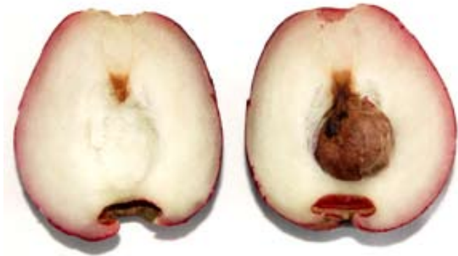
Ripe fruit cut in half to show fleshy seed inside.