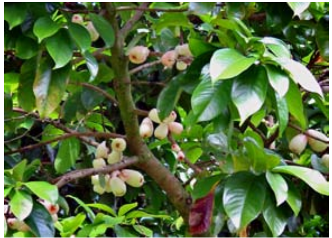
Fruit of white-fruited type.

The tree is quite attractive and highly ornamental, especially when in bloom, and it makes a nice shade tree.