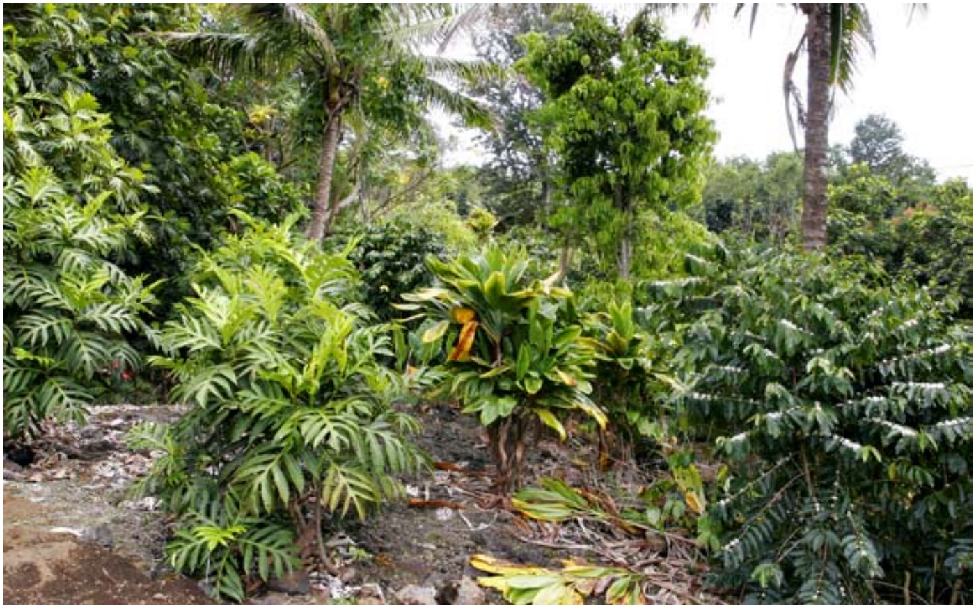
Malay apple grows well in mixed plantings, here surrounded by breadfruit, ti, coffee, and coconut.