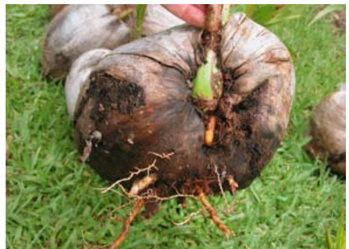
Germinating seednut ready for transplanting.

Germinating nuts are removed at regular intervals (weekly