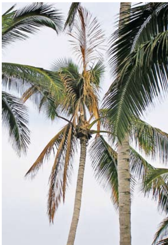
Symptoms of coconut heart rot.

As a commercial crop, the long period from planting to full bearing has discouraged planting. The price of the pri-