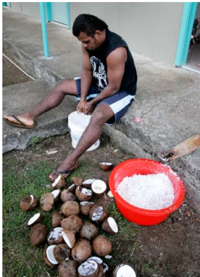
Left: Fish cooked in underground oven wrapped in coconut leaf. Right: Grating coconut for cream is a morning ritual in many Pacific islands. Both photos were taken in Alafua, Samoa.