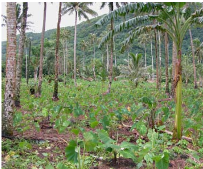
Taro and bananas growing under an old stand of coconuts, Tutuila, Samoa.

over. Betel nut ( Areca catechu ) and some ornamental palms are open to attacks by the pests and pathogens of coconuts grown nearby.