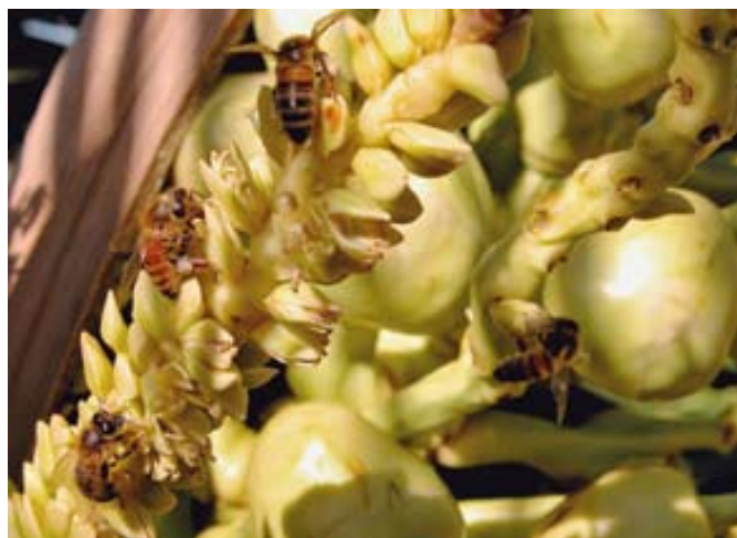
Male flowers with ever-present attending bees.

The young leaves are chewed to a paste and applied to cuts to stop bleeding. Water from a young nut contains sugar and other nutrients and is sterile fresh out of a nut. This