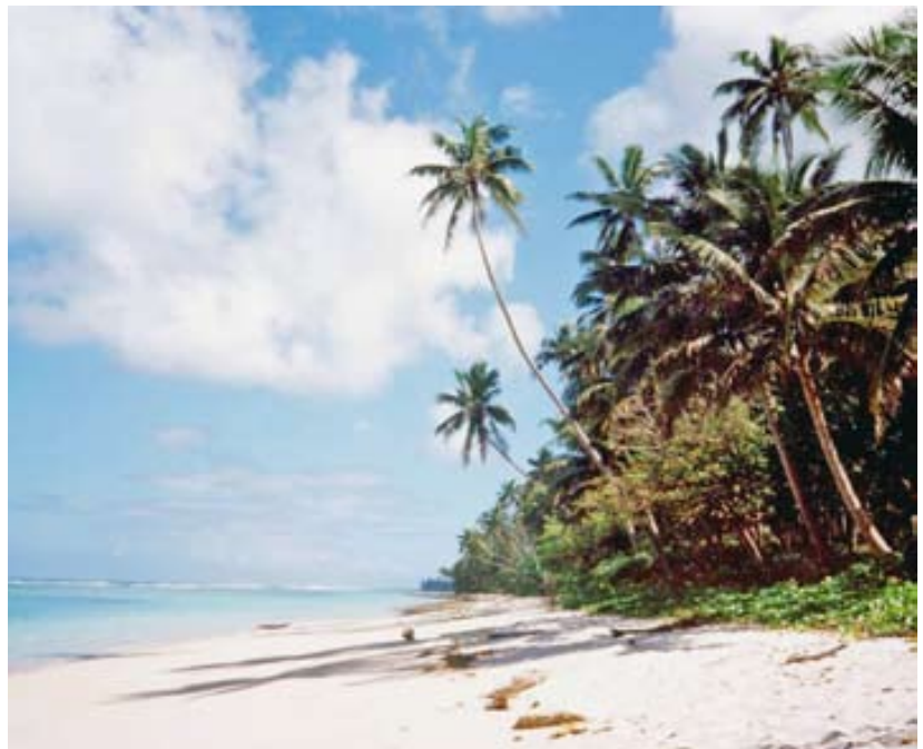
Coconut palms growing on the foreshore of a Pacific island beach. Floating nuts would have been deposited just above the high water mark by large waves, where they then became established.

The coconut palm has wide pantropical distribution. It is a ubiquitous sight in all tropical and subtropical regions 23° north and south of the equator. It is also found outside these latitudes, where it will flower, but fruits fail to develop normally. It is believed that Polynesians migrating into the Pacific 4500 years ago brought with them aboriginal selections (niu vai). At about the same time, people from Indo-Malaya were colonizing the islands of Micronesia. Malay and Arab traders spread improved coconut types west to India, Sri Lanka, and East Africa about 3000 years ago. Coconuts were introduced into West Africa and the Caribbean (including the Atlantic coast of Central