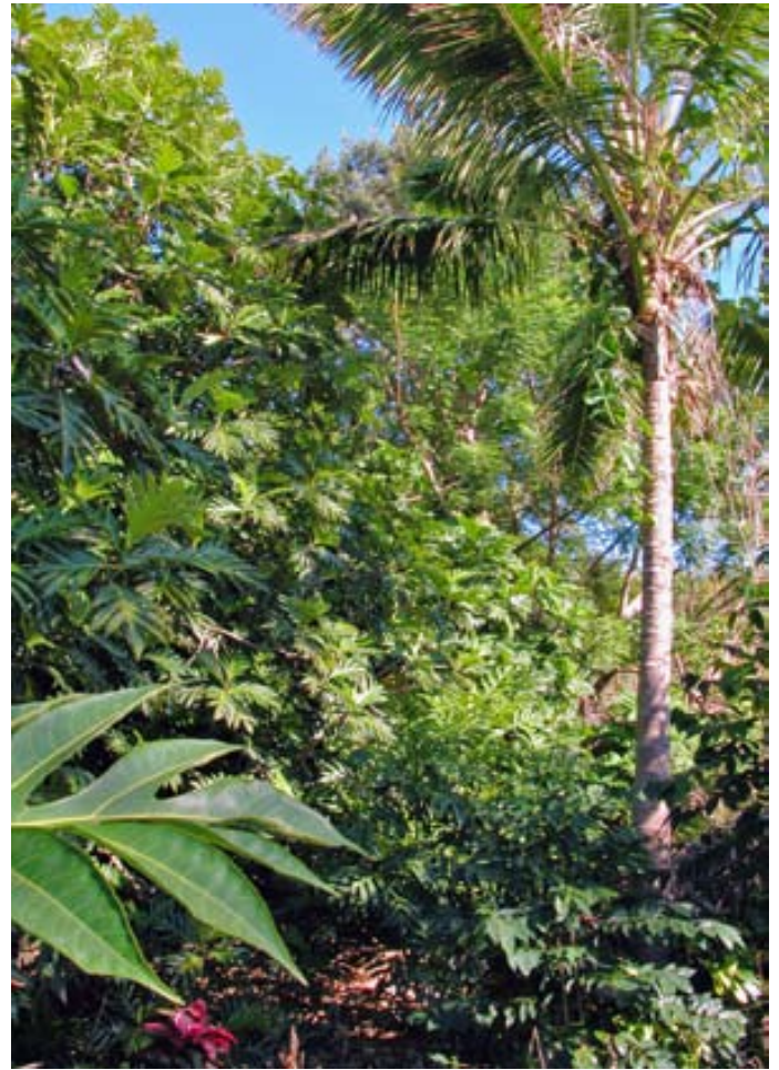
Left: Kava ( Piper methysticum ) and bananas grown as an understory crop, Tongatapu, Tonga. Right: Mixed garden with breadfruit, vi ( Spondias dulcis ), coffee, and many other crops, Kona, Hawai'i.