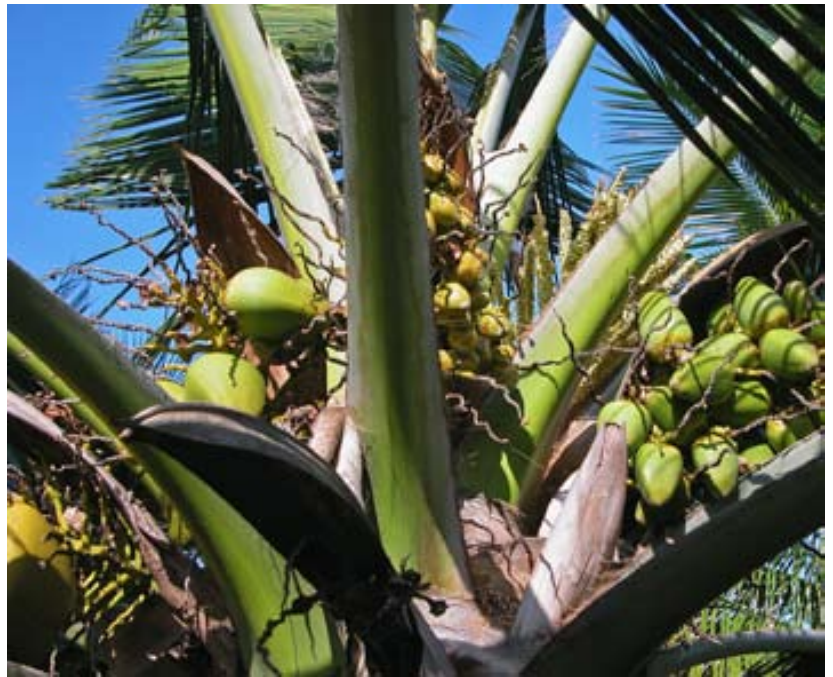
Top: Inflorescence showing spikelets, some bearing developing fruits at their base and all bearing or having borne hundreds of male flowers. Bottom: Fruit in different stages of development.