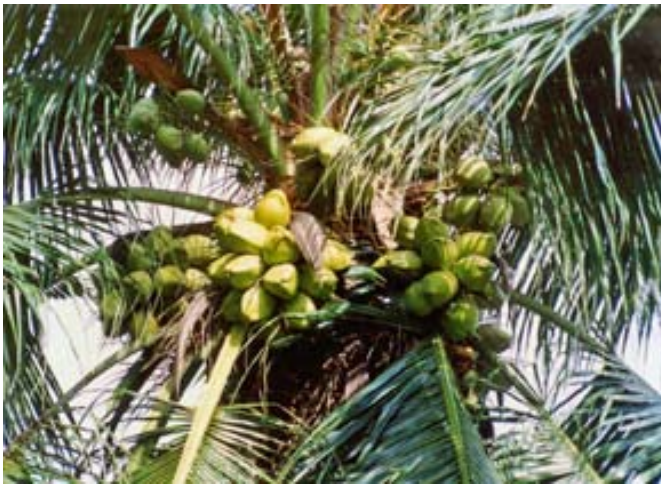
A heavy-bearing palm resulting from a cross between the 'Malayan Yellow' Dwarf and the 'West African' Tall. Yields up to 32 kg (70 lb) copra per palm per year have been recorded.

diseases" above). Generally, these are not treatable or preventable. Mulching with organic materials such as grass and plant clippings or compost will help conserve soil moisture while providing a steady source of organic nutrients, thereby encouraging plant health.