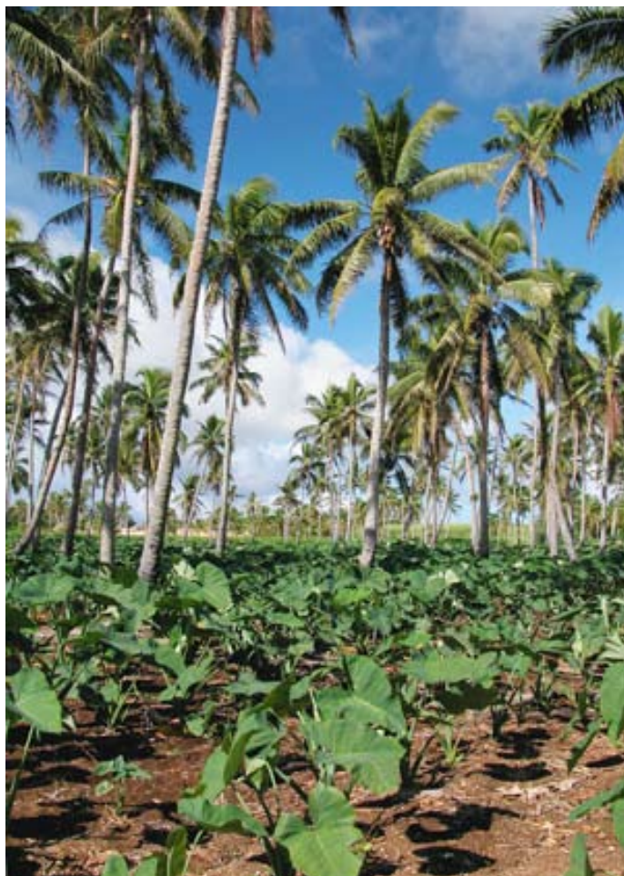
Left: Coconut growing with breadfruit, pandanus, and ti, Kona, Hawai'i. Right: Taro growing under coconuts, Tongatapu, Tonga.