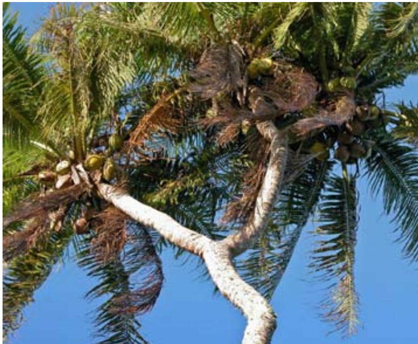
Top: A palm carrying hundreds of very small nuts. Known in Malaysia as “palm with a thousand nuts” (kelapa beribu ribu), it occurs only rarely and has only a curiosity value. Bottom: Branched coconuts are rare. This old coconut on Tongatapu, Tonga, has three branches with full tops loaded with coconuts.