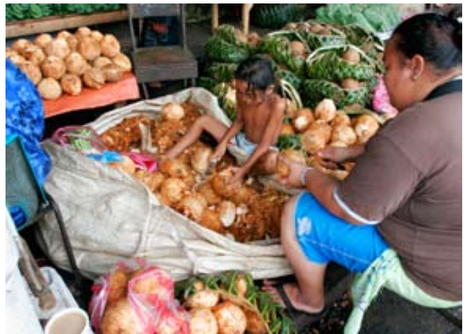
A vendor prepares drinking coconuts for sale at market, Apia, Samoa.

The clear liquid in the interior of a coconut is commonly referred to as “coconut water.” It is a refreshing and cool, acclaimed by many to be the “perfect drink.” In a healthy, undamaged coconut, the water is sterile. Its sodium and potassium content makes it an ideal drink for rehydration. During WWII, coconut water was used intravenously to treat patients suffering from blood loss when blood plasma was not available. It is a ready source of clean drinking water, especially after a natural disaster (cyclones, flooding). Characteristics of the water change as the coconut ages. A very young coconut (about 3–5 months, before the endosperm begins to form) has tasteless water that is somewhat astringent. Water from a mature coconut is slightly salty to the taste, although for coconuts grown well inland, the salty taste disappears. The best time to harvest a coconut for drinking is at age 6–7 months, just as the jelly-like endosperm begins to form. At this stage the water has maximum sweetness and low acidity. Nuts harvested at this age can be stored only 2–3 days before the water begins to sour.