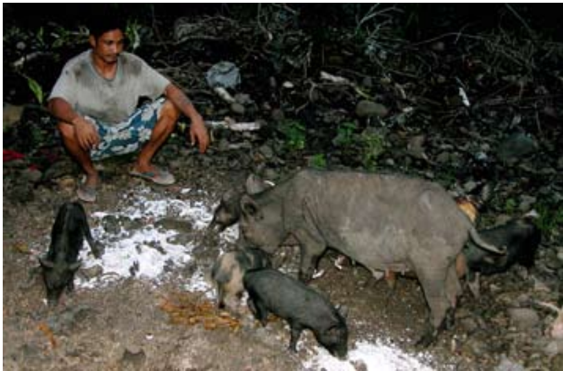
Top: Coconut husks make long lasting mulch for many plants and work especially well for epiphytes such as orchids. Middle: Cattle grazing on pasture under mature coconuts. Bottom: Residue left after extracting coconut cream makes excellent feed for pigs and chickens.