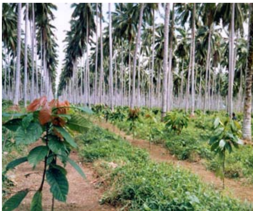
Improving farm productivity by underplanting 40-year-old coconut palms with cocoa ( Theobroma cacao ) in Samoa. The cocoa is 18 months old and when mature will shade out the grasses and lay down a thick layer of leaf litter. Note the increased light penetration through the canopies of the old palms.

Pests and pathogens of coconuts may also affect other palms, and vice versa, but not other crops. Economic palms such as the nipa ( Nypa fruticans ) and rattan ( Calamus spp.) occupy different ecological zones and are thus unlikely to exchange pests and pathogens with coconut. In countries such as Malaysia, Indonesia, and PNG where oil palms have been grown in proximity to coconuts, some coconut pests (rhinoceros beetle and palm weevil) and diseases ( Ganoderma root disease) have crossed