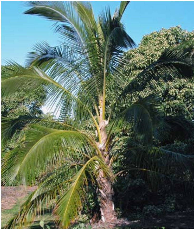
A juvenile at the onset of bearing age, showing rapid vegetative growth.