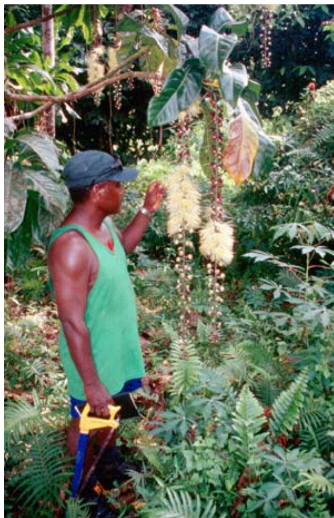
Left: Seedling root system. Right: The author examines flowers B. novae-hiberniae at Vovohe, Kolombangara Island.