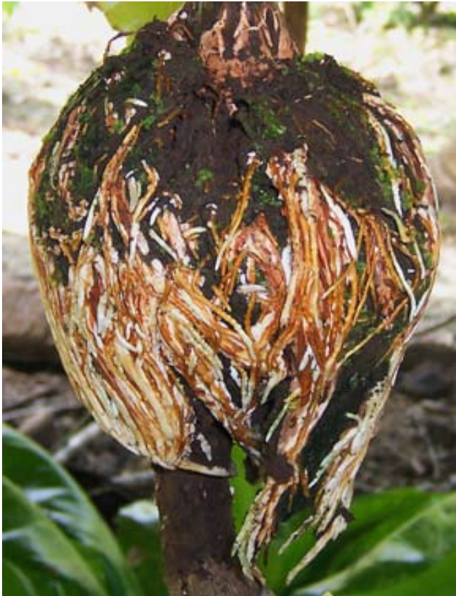
Top: Air-layer on branch in tree. Bottom: Four-week-old air-layer removed from tree. Hunda, Kolombangara, Solomon Islands.

foxes feed on the fruits, and parrots feed on the flowers. Potentially, these animal pests could be drawn to cutnut and thereby introduced to other tree and field crops within the same area.