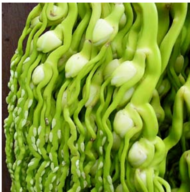
Top: Inflorescence. Bottom: New inflorescence showing both female (large) and male (small) flower buds.