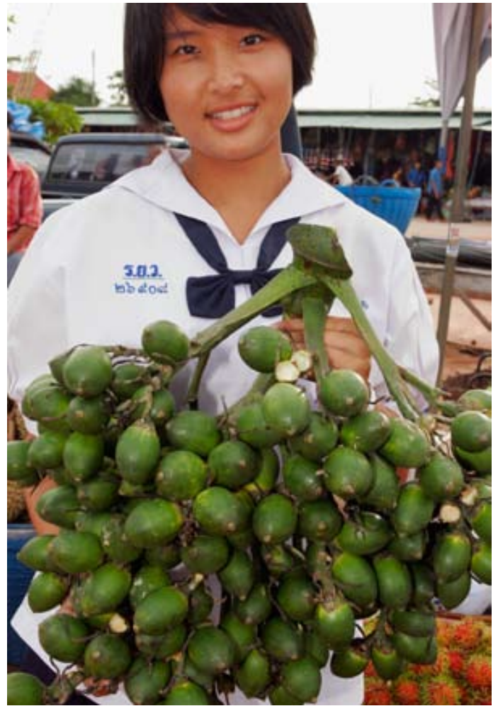
Left: Betel nut for sale in main market, Honiara, Guadalcanal, Solomon Islands. Right: Fruits for sale, Rayong, Thailand.

through extended-family networks or sold in village stores or farmer markets.