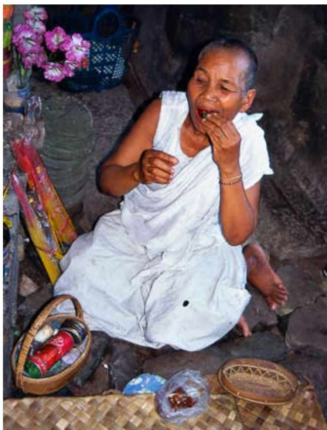
Female monk putting quid in her mouth, Ankor Wat, Cambodia.

The dried nuts, whole or sliced, are the primary commercial product in international trade. Fresh nuts, either ripe or unripe, are an item in local commerce only, as they do not ship well. The commercial product is prepared from ripe