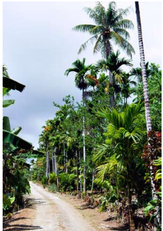
Betel nut palms in polyculture on Yap Island, Micronesia.

Permanent intercropping takes place using bananas, cacao, cardamom, fruit trees (guava, jackfruit, mango, orange, papaya, plantain, coconut), or guinea grass as fodder. In India pepper vines (betel pepper, Piper betle ) or black pepper ( P. nigrum ) are often trained onto the trunks of betel nut palms.