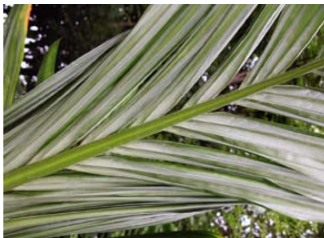
Leaf underside.

The main problems of intercropping are competition for nutrients, sunlight, and water between the betel nut palms and the intercrop. Too close spacing is the primary cause of these problems.