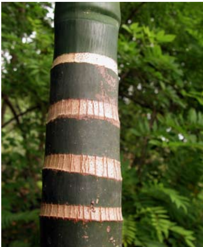
Characteristic leaf scars of betel nut palm trunk.

There are more than 50 species of Areca , and some produce