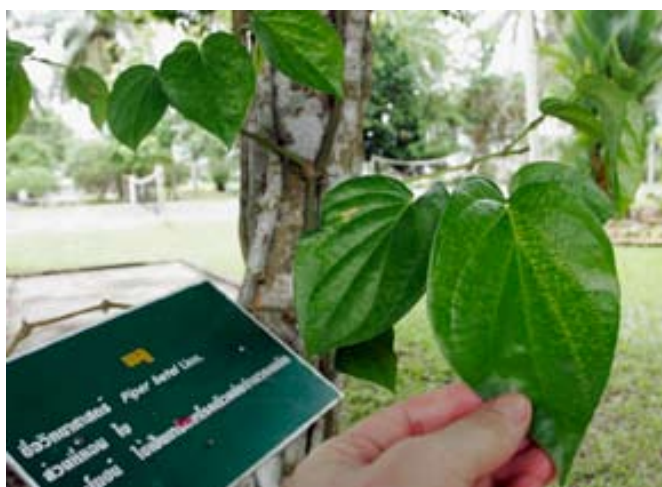
Leaves of betel vine ( Piper betle ).

Betel nut palm is ideally suited for tropical everwet climates (humid tropical lowland, maritime tropical, subtropical wet, tropical wet forest) with high rainfall that is evenly distributed throughout the year. In areas with a seasonal dry period, irrigation must be provided to assure evenly distributed moisture year-round. These palms are unable to