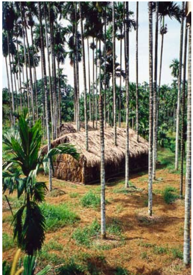
House made from betel nut palm in grove; all parts of the house are made out of betel nut palm, including trunks for posts and beams. Photo taken at a betel nut palm research center in Kerala, India.

The fresh or dried endosperm of the seed is the betel nut of commerce. The betel quid (wad of chewable ingredients) includes the fresh or dried seed of betel nut, a fresh leaf of betel pepper ( Piper betle ), a dab of slaked lime, and various flavorings (cutch, cardamom, clove, tobacco, or gambier). Eight closely related alkaloids are responsible for the stimulant effect; the alkaloid levels are highest in the unripe fruit and this may be why some cultures prefer the unripe nuts for consumption: they give a better buzz. Note that when chewed for the stimulant effect betel quid is never swallowed and the copious saliva resulting is spat out. However, when used medicinally betel nut may be taken internally. One of its effects is a powerful stimulus to intestinal peristalsis; betel nut is used to treat a long list of ailments. The Indian pan (pronounced pon) is a common