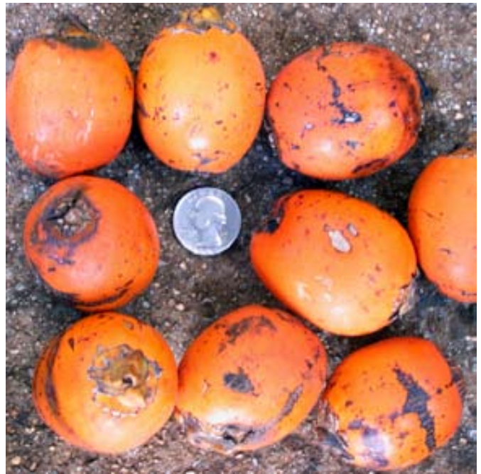
Ripe fruits with U.S. quarter dollar for scale.

The Chinese betel nut or Manila palm ( Veitchia merrillii ) is often confused with Areca catechu . The Chinese betel nut palm differs from Areca catechu in having a thicker trunk and dense clusters of bright red fruits. It is a popular landscaping tree and can be commonly seen in parks, along roadways, and in homegardens. The fruits can be used for chewing when ripe, although they are an inferior substitute for betel nut.