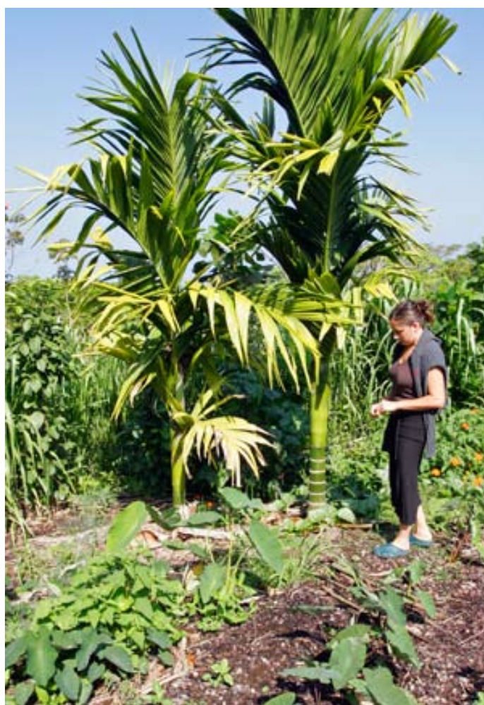
Left: Betel nut palms serving as trellis for Piper betle . Betel nut palm research center in Kerala, India. Right: Young palms growing on the border of a vegetable garden. Kona, Hawai'i.