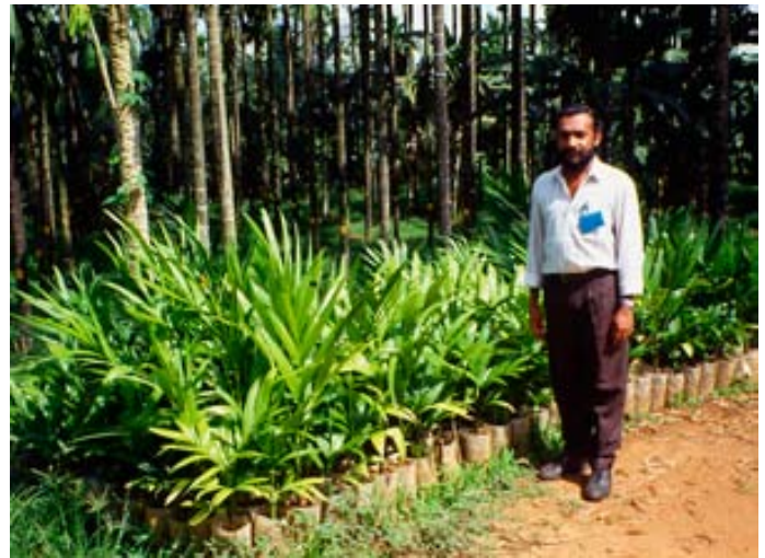
Left: Seedlings of betel nut palm from Pohnpei Island, Micronesia. Right: Seedlings of betel nut palm with mature betel palms in background, India.