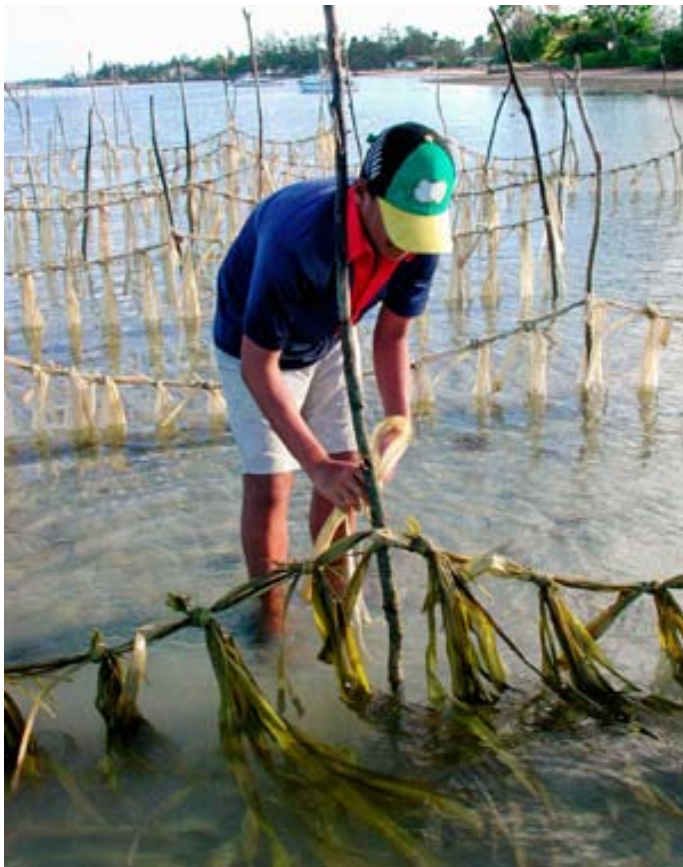
Soaking leaves in sea water. Kie variety (syn. P. spurious ), Ha'apai, Tonga.