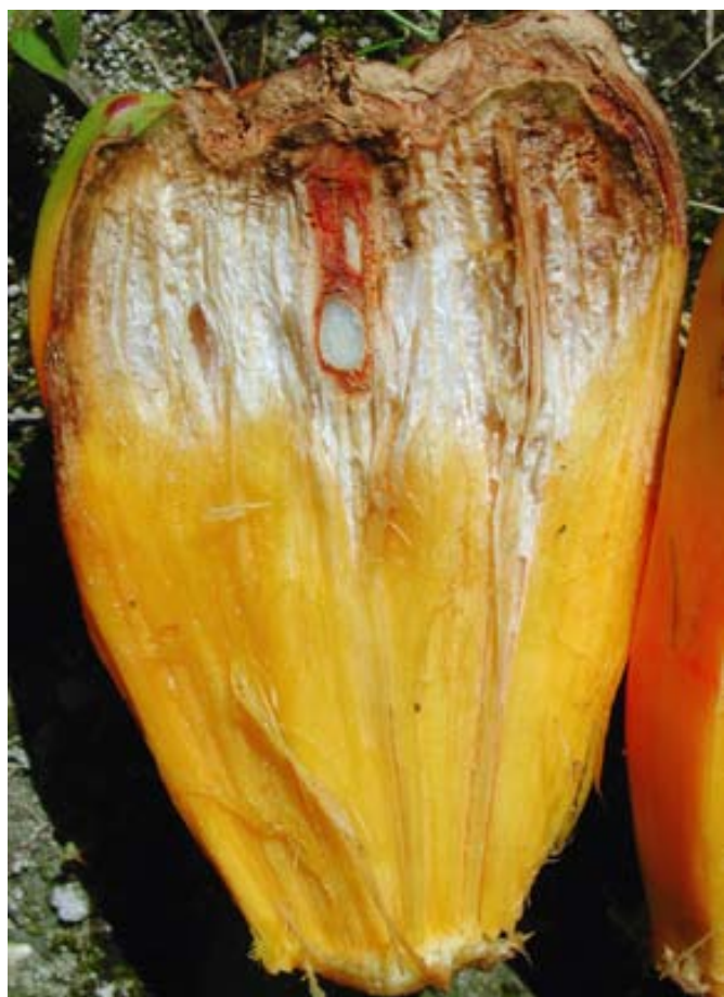
Phalange split lengthwise to reveal a seed (cut in half).

The following Pandanus species occur naturally and/or are