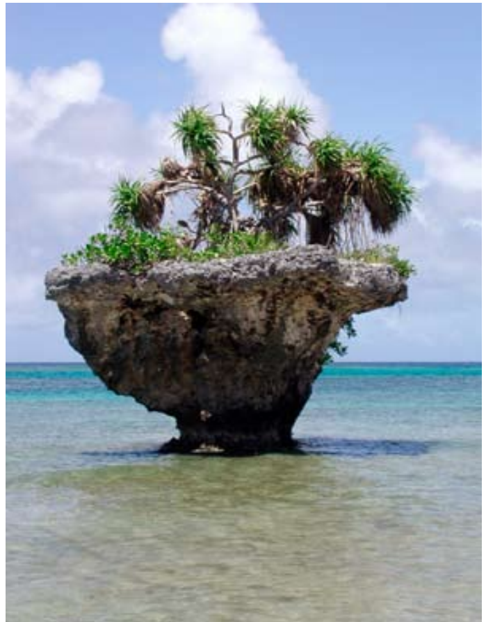
Left: Trees grow in very harsh, windy conditions such as here on east coast of ‘Eua, Tonga. Right: Pandanus colonizing limestone pillar in Ha‘apai, Tonga.