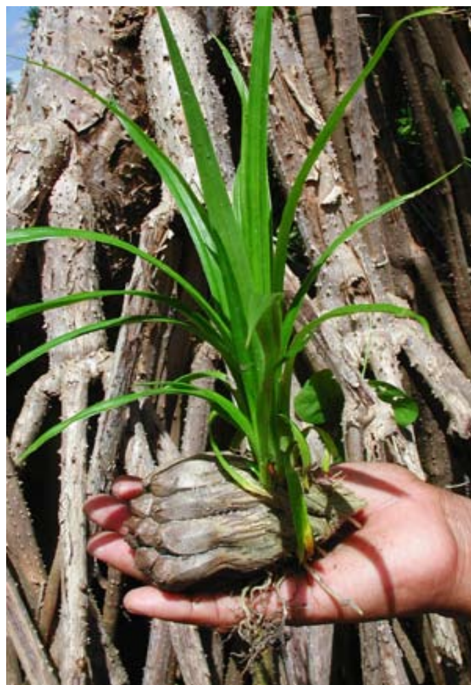
Left: Propagation of pandanus seedlings in Forestry Division Nursery, Vava'u, Tonga. Right: Volunteer seedling ready for transplanting.