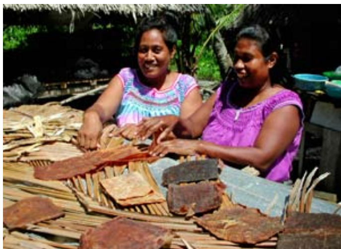
Left: Drying pandanus fruit paste in the sun, Kiribati. Right: Roll of preserved fruit paste, as traditionally packaged in pandanus leaves, Marshall Islands.

A 100 g portion of edible pericarp is mainly comprised of water (80 g) and carbohydrates (17 g). There are also significant levels of beta-carotene (19 to 19,000 µg) and vitamin C (5 mg), and small amounts of protein (1.3 mg), fat (0.7 mg), and fiber (3.5 g) (Dignan et al. 2004, Englberger et al. 2003, Englberger et al. 2006a and 2006b). The edible flesh of deeper yellow- and orange-colored varieties