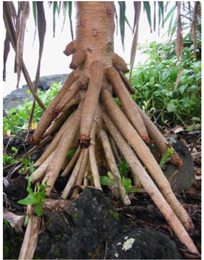
Left: Characteristic ring pattern on bark left after older leaves fall off. Right: Prop roots descending into a thin substrate over lava rock, 'Upolu, Samoa.

cultivated in near-coastal locations in the Pacific islands and are sometimes confused with the P. tectorius complex.