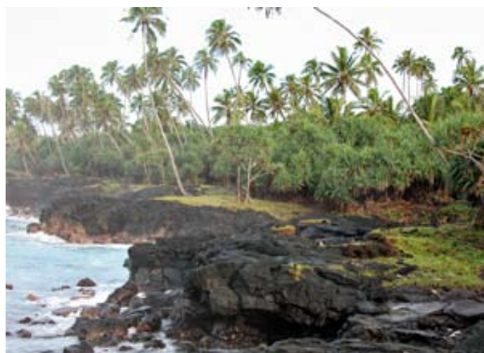
Left: Typical littoral forest community including beach heliotrope ( Tournefortia argentea ) and beach she-oak ( Casuarina equisetifolia ), Houma, Tongatapu, Tonga. Right: Pandanus often grows on shorelines exposed to salt spray and wind, 'Upolu, Samoa.