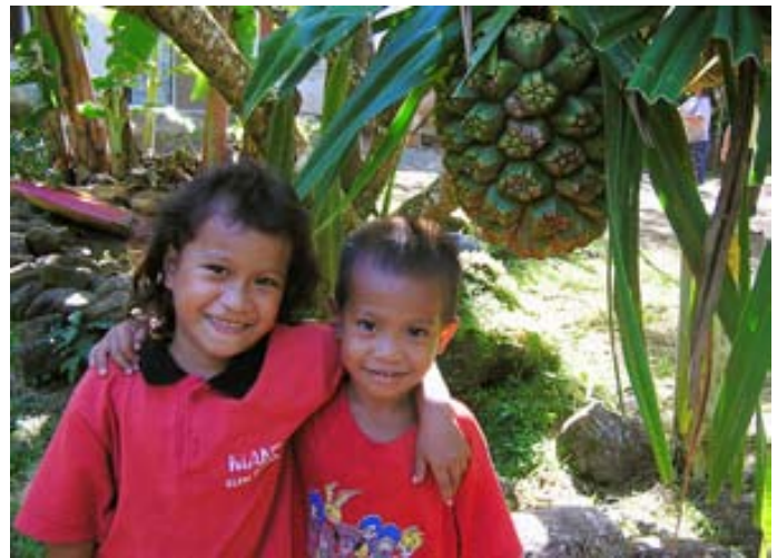
Left: Colorful phalanges are often used in personal adornment, such as here in Cook Islands. Top right: A local expert teaches pandanus leaf weaving, Kealakekua, Hawai'i. Bottom right: Children in the Pingle-lapese village of Mand in Pohnpei enjoy the shade of a pandanus tree bearing edible fruit.