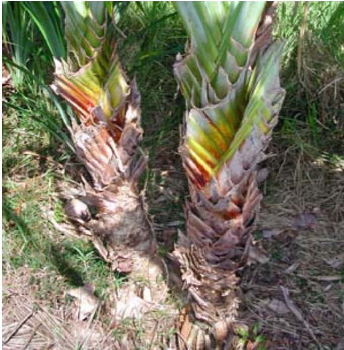
Plant from which leaves have been harvested. Paongo variety (syn. P. whitmeeanus), Vava'u, Tonga.