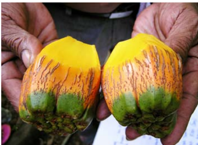
Keys of the edible cultivar 'Enewedak'.

The keys of selected edible cultivated varieties, those with