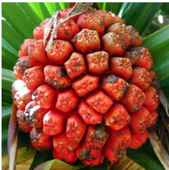
Different fruit types. Top: ‘Antinakarewe’ (Kiribati). Middle: Unnamed variety (Kiribati). Bottom: ‘Fala’hola’ (Tonga).