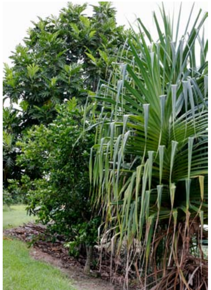
Left: Variegated plant, Ho‘omaluhia Botanical Garden, Kaneohe, Hawai‘i. Right: Growing in mixed garden together with citrus and breadfruit ( Artocarpus altilis ) at 460 m (1500 ft) elevation, Kona, Hawai‘i.