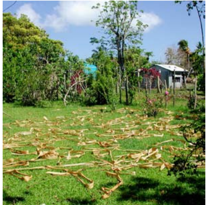
Drying leaves. Ha'apai, Tonga.