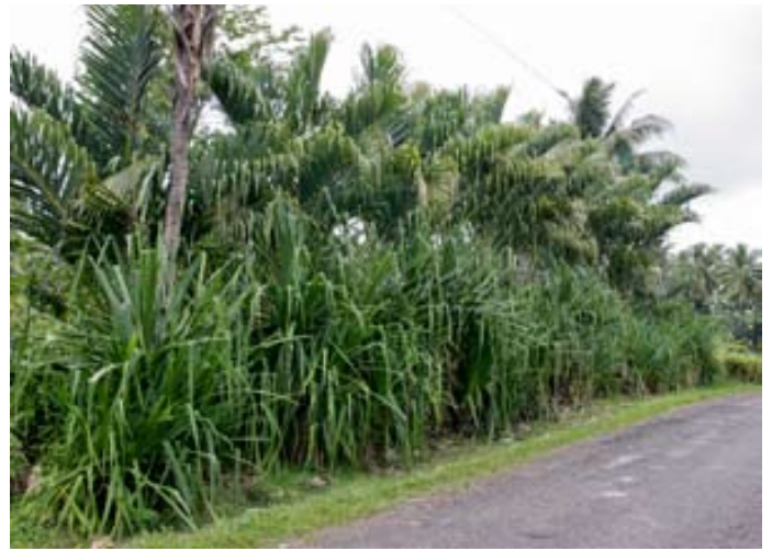
Left: House thatched with pandanus in Butaritari, Kiribati. Right: A boundary hedge of pandanus together with sago palm ( Metroxylon warburgii ), ‘Upolu, Samoa, which serves as a cultural resource for craft materials.

aging effects of salt-laden winds. Pandanus is often planted as a windbreak in atolls to protect crops from salt spray.