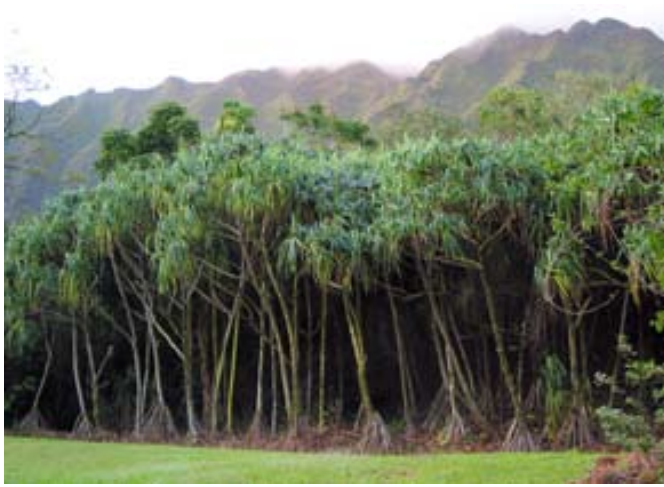
In many areas, pandanus forms dense stands, such as here in Kaneohe, Hawai'i.

ing along the coast. Leaves are yellowing and trees are now in very poor health.