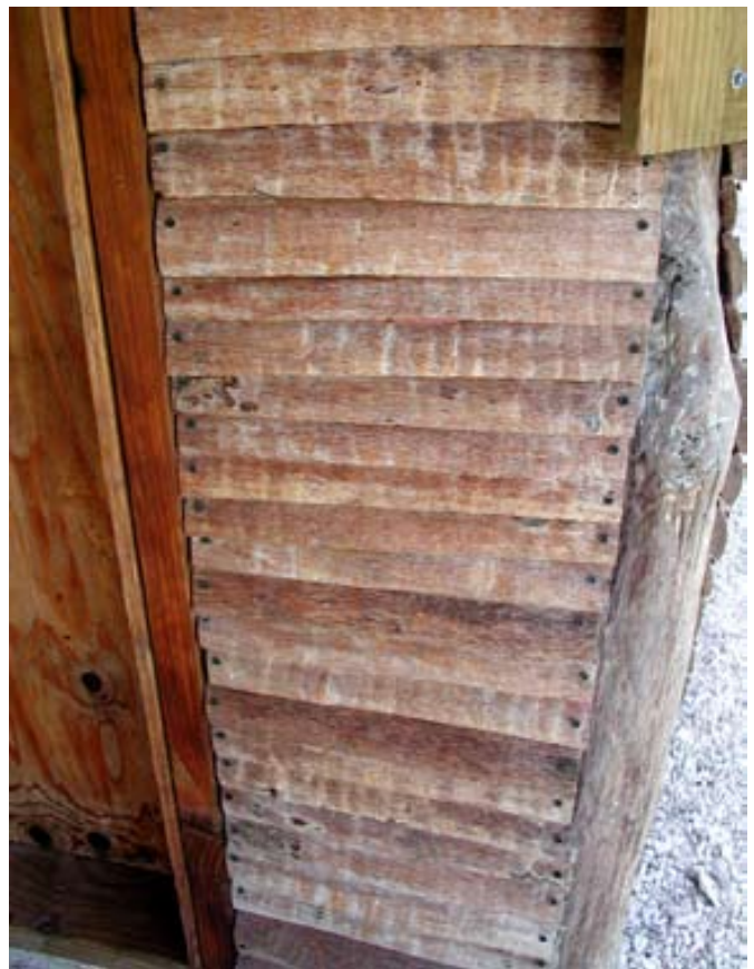
Top: Thatch wall. Bottom: House side panel made of pandanus slats.