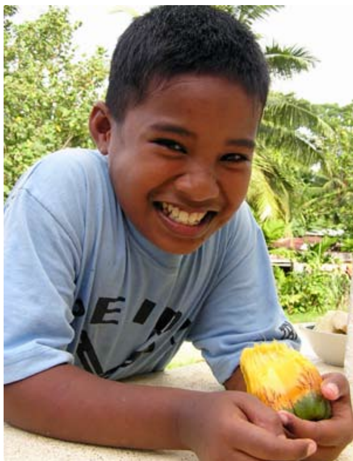
Left: A village leader in Mand Village, Pohnpei, displays an open bunch of the cultivar 'Aspwihrek', prized among Pingelapese for its edible fruit. PHOTO: A. LEVENDUSKY. Right: A key of the edible cultivar 'Enewedak' is happily held by a boy in the Pingelapese village of Mand, Pohnpei. PHOTO: L. ENGLBERGER