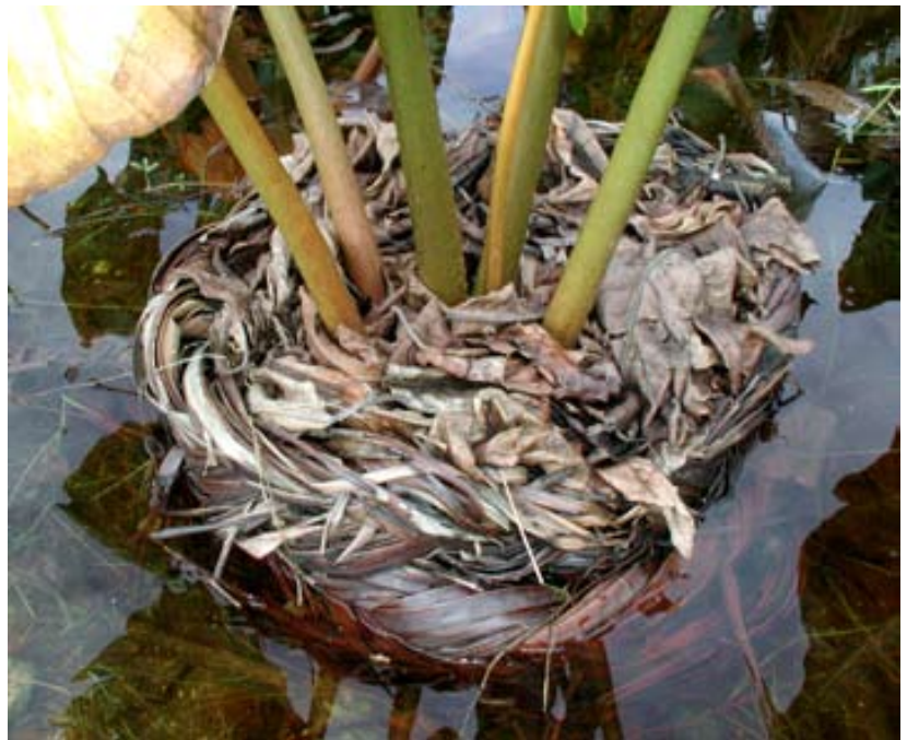
Top: Boundary planting of pandanus around mixed agroforestry, Tongatapu, Tonga. Bottom: Woven basket of pandanus leaves in which fertilizer and mulch is placed around the bases of the largest ceremonial giant swamp taro plants.

of Economic Botany, New York Botanical Garden, New York.