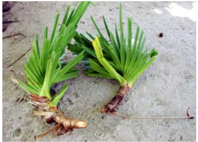
Branch cuttings for propagation; note aerial roots are still attached and leaves are trimmed.

The leaf area is reduced by about 70% by cutting and trimming the leaves.