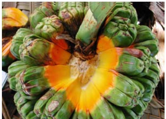
Top left: Male inflorescence. PHOTO: C. ELEVITCH Top right: Female inflorescence. PHOTO: C. ELEVITCH Bottom: Fruit heads comprise an aggregate of many tightly bunched wedge-shaped phalanges or drupes; these are also called “keys,” as removing one will allow the rest to come apart easily. PHOTOS: L. THOMSON