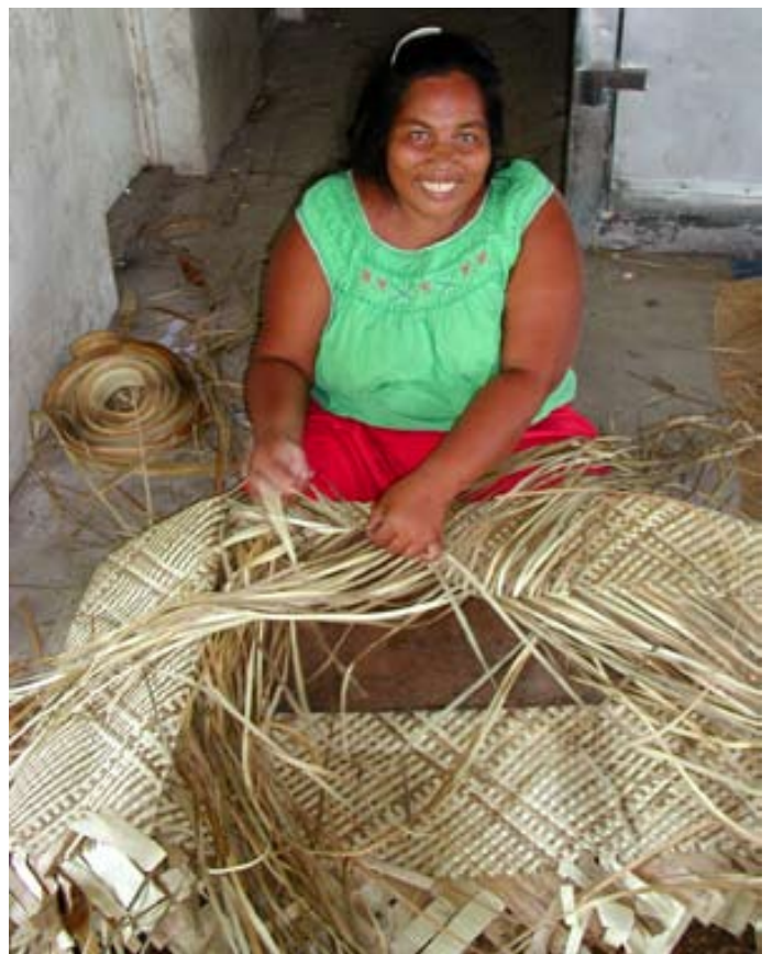
Weaving of mat, Butaritari, Kiribati.