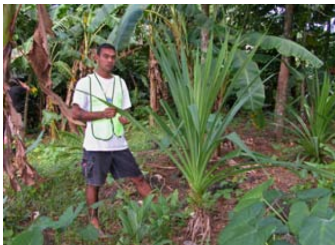
Pandanus planted in understory of mixed garden, American Samoa.