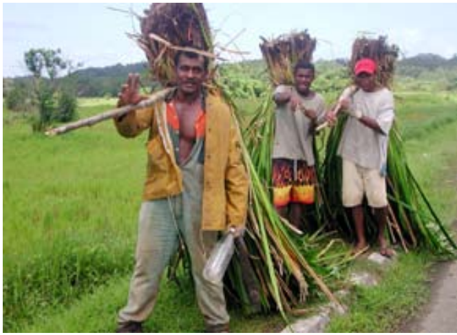
Harvesting of leaves for thatch on building structures. Misi-misi variety, Wainidoi, Fiji.

end can be used as a brush for decorating tapa, with the hard, woody outer end acting as a handle. Fish traps are made out of the aerial roots in Kiribati.