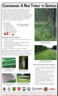
Full Color Publications