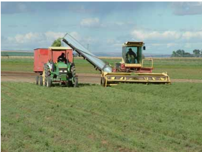
WSDA Certified Organic Producer harvesting crops.