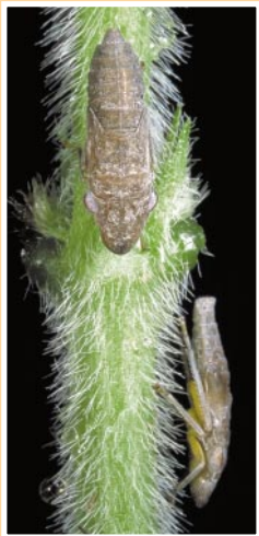
The immature nymphs are wingless.

Native to the southeast United States, this insect was first observed in California in 1990 and is now found throughout Southern California and parts of Kern County. It is a particular threat to California vineyards due to its ability to spread Xylella fastidiosa , the bacterium that causes Pierce's disease. Pierce's disease kills grapevines, and there are no effective treatments for it. Glassy-winged sharpshooters have led to a Pierce's disease epidemic in the Temecula region of Southern California that threatens the survival of its viticultural industry.