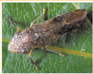
Glassy-winged sharpshooters are large insects, about 1/2 inch long.

In addition to Pierce's disease, X. fastidiosa causes almond leaf scorch, alfalfa dwarf, oleander leaf scorch, and citrus variegated chlorosis. The potential spread of these diseases by the glassy-winged sharpshooter should be of concern to agricultural producers throughout California.