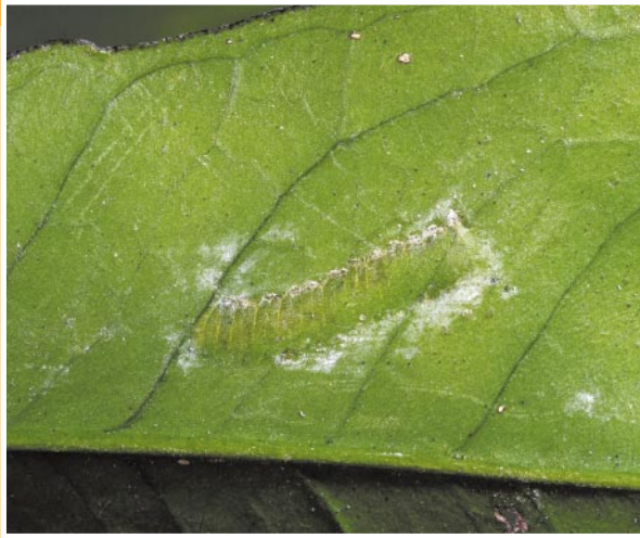
Glassy-winged sharpshooter eggs are laid together on the underside of leaves, usually in groups of 10 to 12. The egg masses appear as small, greenish blisters. These blisters are easier to observe after the eggs hatch, when they appear as tan to brown scars on the leaves.

Download a copy of this brochure from http://danr.ucop.edu or http://danrcs.ucdavis.edu