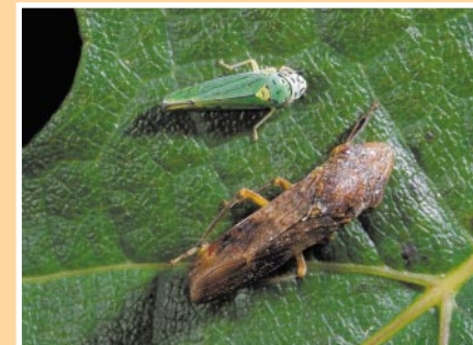
The glassy-winged sharpshooter is shown next to the smaller blue-green sharpshooter.

Early detection of the glassy-winged sharpshooter in Central and Northern California is important for developing control strategies. Growers can be of great assistance in this effort. Yellow sticky traps, even those used to detect other insects such as apple maggots or blue-green sharpshooters, are useful for monitoring the glassy-winged sharpshooter. Plants can be examined by direct observation or by using a sweep net. Look for adult insects, nymphs, and egg masses.