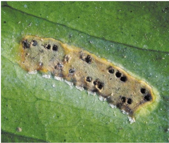
Parasitized egg masses are tan to brown in color with small, circular holes at one end of the eggs.