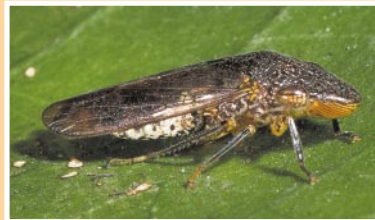
The glassy-winged sharpshooter gets its name from its transparent wings.

The glassy-winged sharpshooter feeds on a wide variety ornamental and crop plants. On most plants, it feeds on stems rather than leaves. When feeding, it excretes copious amounts of watery excrement in a steady stream of small droplets. In urban areas, this "leafhopper rain" can be a messy nuisance. When dry, the excrement can give plants a white-washed appearance.