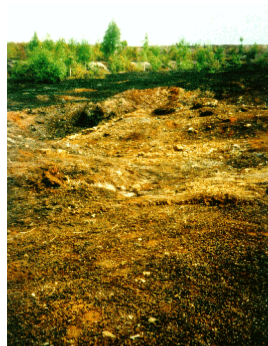
Orzel Bialy smelter waste pile in 1994, before remediation efforts began.

Since the fall of Communism in 1989, new laws and regulations have been enacted to protect and restore the environment. Progress has been made with advances such as the installation of stack emission scrubbers and the construction of wastewater treatment plants. However, intense economic and employment pressures have hindered environmental efforts. Any plan for remediating the waste piles would need to be inexpensive.