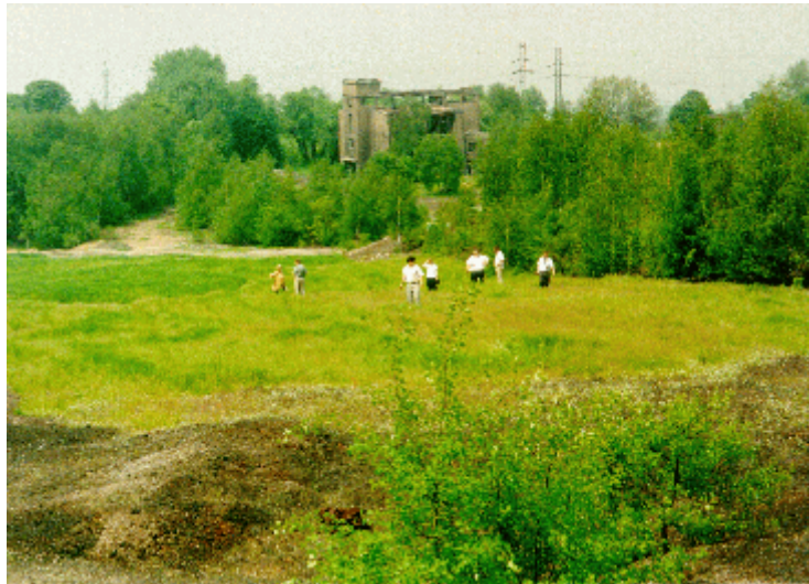
Orzel Bialy smelter waste site in 1996.

Two sites were chosen comprising smelter wastes from a Doerschel furnace and a Welz smelting process. The site covered a total of 2 ha, all of which was barren of vegetation. Before installation of the experiment, it was important to assess the exact chemical and structural nature of the waste piles. Samples from over 160 grid points (from 0 -5 and 20 -