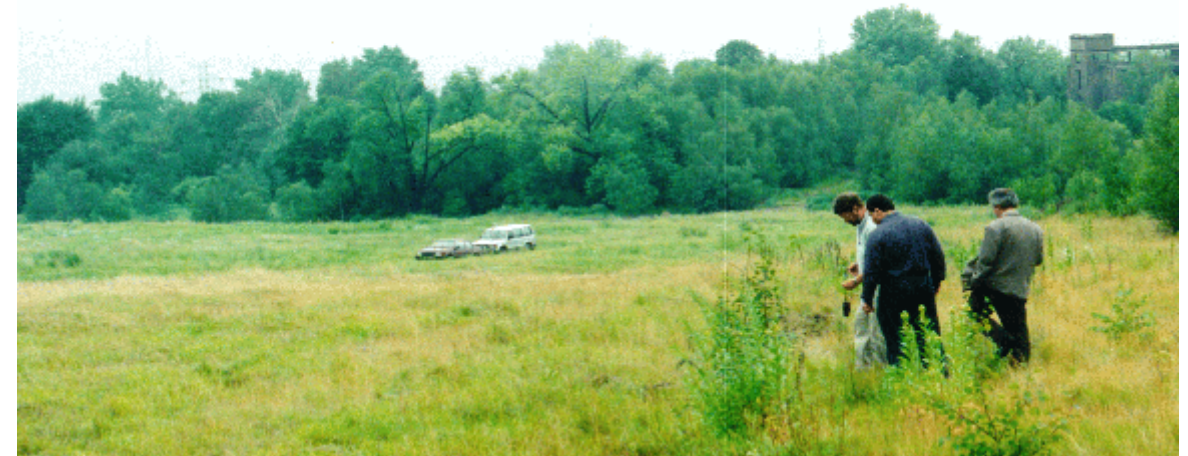
Native woody species can be seen returning to the Orzel Bialy smelter waste site in this 1999 photograph.

The exact amounts of amendments and seeding mixtures should be based on a detailed survey of the chemical properties of the waste at the site. For heavily contaminated sites, such as the Doerschel site, a lime cap with a high percentage of calcium