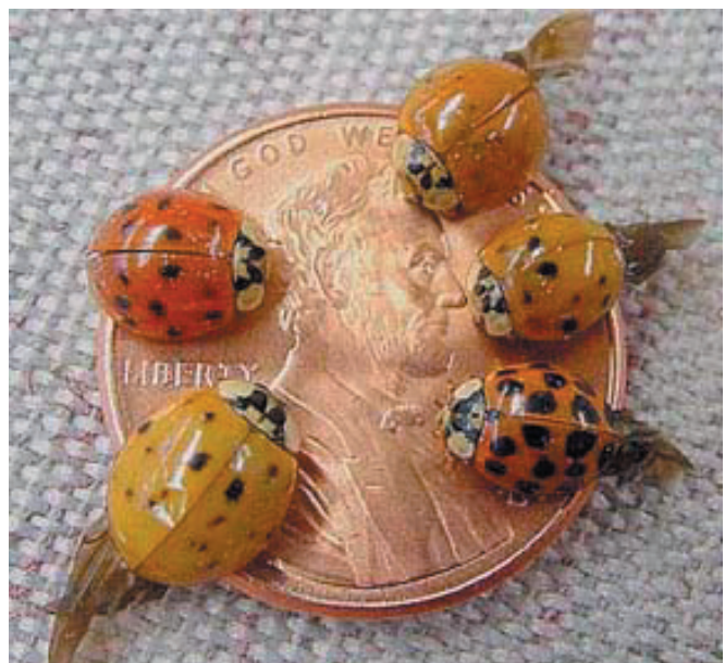
Asian lady beetles with various colors and spot patterns