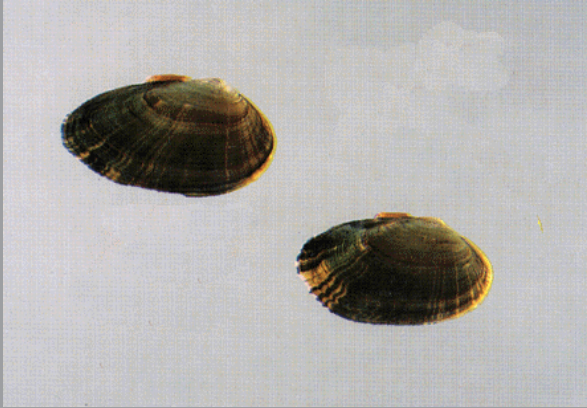
Male (top); Female (bottom)