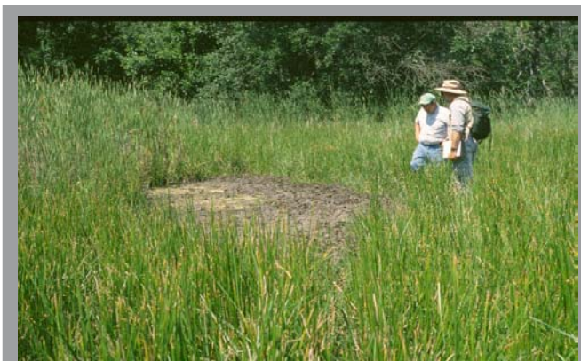
Open salt marsh in dry year.

Vegetation Description: Because occurrences are small and widely scattered, each site tends to have a distinct composition (Faber-Langendoen 2001, NatureServe 2001). Dominant species vary from marsh to marsh, and