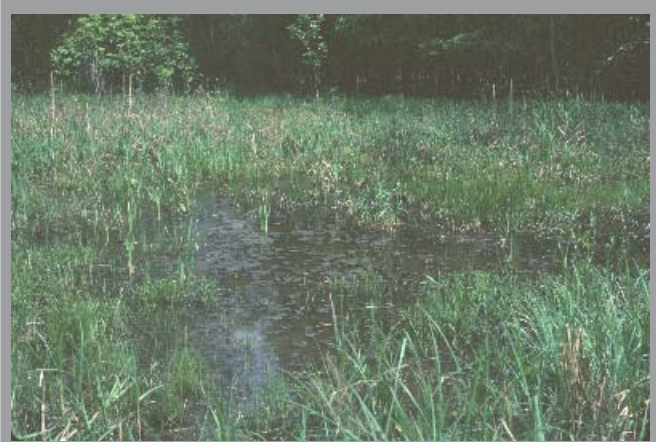
Open salt marsh in wet year.