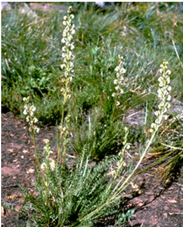
Pedicularis contorta , a variable species from the Northern Rockies

New Mexico, on the southern edge of the Cordillera, has five or six species of Pedicularis ...Alaska as something like twenty species.