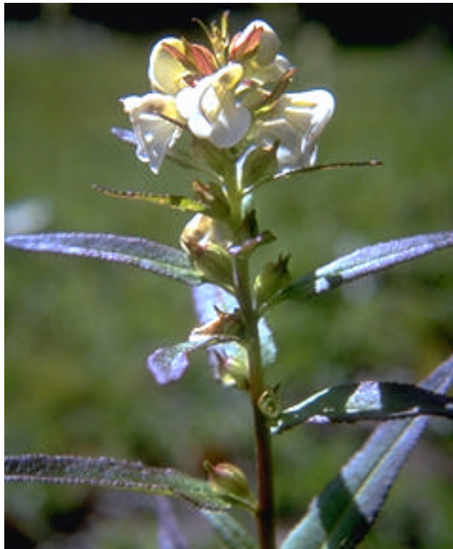
Pedicularis racemosa - Parrot's Beak. Frequently parasitic on Firs and Spruce... widespread, with flowers varying from bright yellow (southern range) to creamy-white (more common)