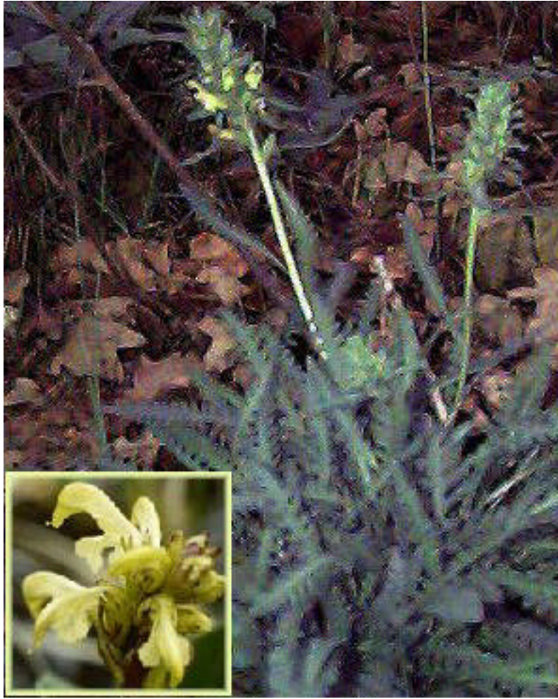
Pedicularis parryi , found in lower altitudes of the southwest and central west United States. Often found growing on Thermopsis and Prunus spp.

SOUTHWEST SCHOOL OF BOTANICAL MEDICINE PO Box 4565, Bisbee, AZ 85603