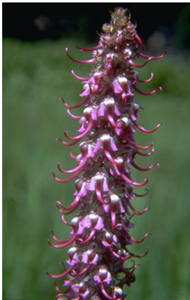
Pedicularis groenlandica or Elephant's Head. Found in meadows and snow bogs throughout Western North America in giddy pink profusion. Seldom parasitic.

NOTE: Like Vaccinium or Datura , different strains of the same species can vary a great deal in relative strength. Eating some of the fresh plant of a strong strain will offer a mild muscular-skeletal lethargy. If you try this at 10,000 feet, five miles in from the trailhead, you will just have to sit down for a couple of hours and giggle...you ain't goin nowhere for awhile..