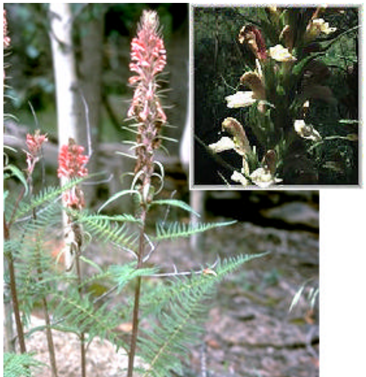
Pedicularis grayii, found in the Southern Rockies. Two flower variations are shown