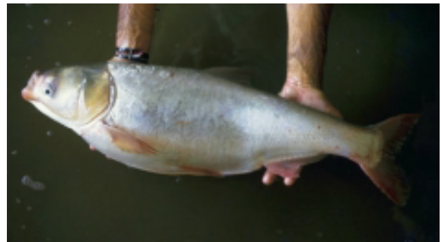
Silver carp.

The latest aquatic invaders, and certainly the largest in the great rivers of the United States, Asian carp are becoming all too common. These invasive species, specifically silver and bighead carp, continue to spread widely throughout the Mississippi River basin. USGS researchers at the Columbia Environmental Research Center are in the process of tracking their movements and habitat selection. Evidence indicates that these carp feed even during cold weather, and they have been observed making upstream migrations of many miles. Asian carp are well-adapted to the Nation's large river systems, posing a real problem in terms of competition with and predation on native fishes in our aquatic freshwater systems. One particularly annoying habit is that these carp jump into moving boats, threatening passengers with serious injury as these fish can reach upwards of 50 pounds. A potential control method of these unwanted species is for the USGS to develop a sex pheromone, a chemical substance produced by individuals that serves as a stimulus to other individuals of the same species. It is a ready-made attractant that could be used in a species-specific trapping program. At some point, long-term effects of Asian carp must be evaluated through the develop-