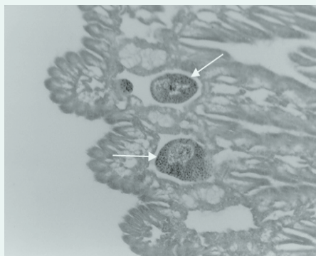
Ciliated parasites in Crassostrea virginica . Arrows indicate examples.

The histopathology component of the Mussel Watch Program, quantifies the stage of gamete development, and the prevalence of nearly 70 diseases and parasites found in mussels and oysters. Trends in histopathology data may help to assess the effects of global warming.