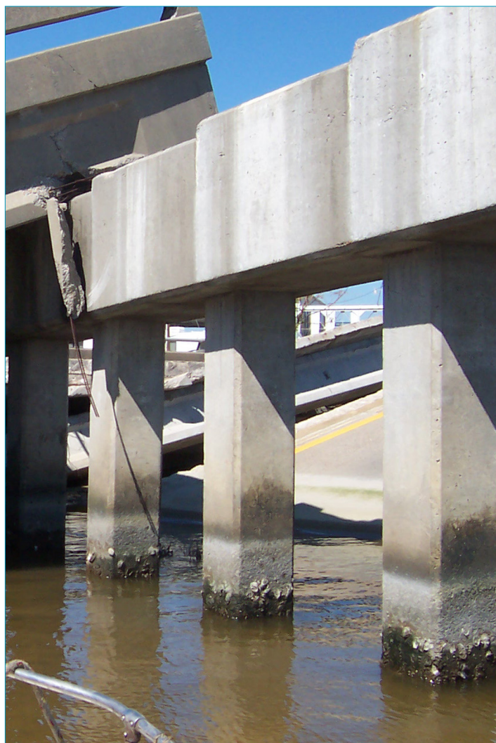
Mussel Watch site under bridge in Mississippi after Hurricane Katrina.

The histopathology component of the Mussel Watch Program, quantifies the stage of gamete development, and the prevalence of nearly 70 diseases and parasites found in mussels and oysters. Trends in histopathology data may help to assess the effects of global warming.