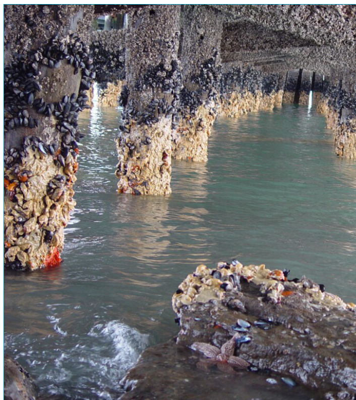
Creosote piling are sources of polycyclic aromatic hydrocarbons.

We have chosen to present a subset of the status and trends for trace metals in this report. There are two principal reasons for this, 1) several of these elements are considered to be abundant “earth metals” and 2) the current state of science and associated methods are less certain of guaranteeing accurate and precise quantitation of several metals. Chromium (Cr), Antimony (Sb), Silver (Ag) and Thallium (Tl) can be counted among those difficult to quantify. Moreover, Thallium is generally found in such low concentrations that our ability to detect its mere presence is restricted. Aluminum (Al), Iron (Fe), Silicon (Si) and Manganese (Mn) are all abundant earth metals. As such, the overriding signal for these chemicals tends to be a direct correlation to local earth crustal composition.