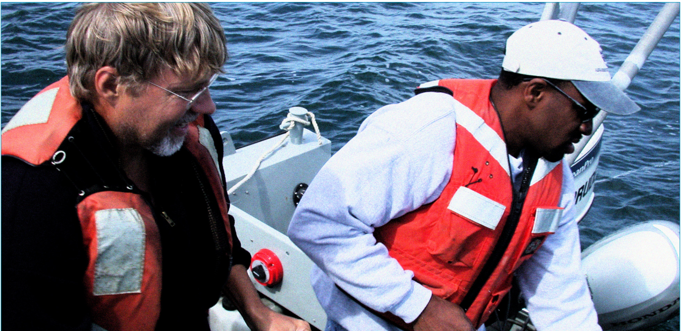
Great Lakes field sampling.

Spearman's rank correlation statistical test was used to evaluate individual contaminants at the site, regional and national scales. Results are presented as decreasing (▼), increasing (▲) or exhibiting no trend (●). The symbology allows the reader to quickly ascertain if concentrations are changing. It is important to note that "no trend" is not necessarily an indication of a lack of management. Rather, it is possible that some contaminants are already at very low levels and that significant reductions are unlikely. As such, it is critical to keep the status component in mind as the reader interprets the trends section.