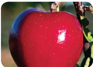
Kumeu Crimson® Braeburn

Honeycrisp is a well balanced, sub-acid flavor apple with juicy texture. It matures one week after McIntosh. It has long storageability and is one of the most popular varieties in the marketplace today.