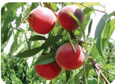
Spring Flame® 22 Cv. 'Burpeachnineteen' (E8.010)

This peach has very good size, color, flavor, and firmness. The tree is productive, but moderate in vigor when young. Its fruit is becoming a standard of the early season. It conditions well and ripens approximately in the 21st week of the year. Commercially planted. USPP#12,156.