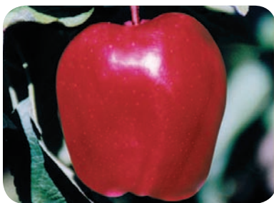
Scarlet Spur II Red Delicious

A sensational new sport of Red McIntosh, RubyMac features high vibrant blush color. The fruit develops its blush well ahead of other McIntosh strains. Many who have seen RubyMac consider it to be the best coloring McIntosh on the market today. RubyMac delivers consistent high-grade packouts. It has the excellent quality, fruit firmness, great taste, and texture that have made this apple a classic. BT 1035 cltv., USPP pending.