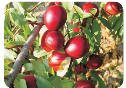
Flamin' Fury® PF-11

A week earlier than Stark EarliGlo. We started picking our 2008 test crop July 3. In a more typical season these could be picked at the end of June. With the size, appearance, and taste of a later-season peach, this one's a winner for the early season. Few split pits. Semi-freestone. USPP#9,850.