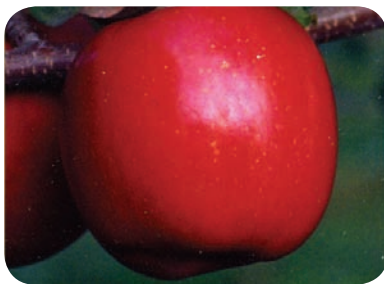
Banning Red Fuji™

One of the first early maturing Red Fuji sports, this proven strain matures about six full weeks ahead of other Red Fuji selections yet produces a higher percentage of Washington Extra Fancy fruit. When famed Washington orchardist Grady Auvil discovered this new Fuji sport, he predicted "it will revolutionize the Fuji market." Its fruit flavor, tree structure, and growth habits appear to be identical to other Red Fuji selections. Fuji 216 cltv., USPP#10,141.