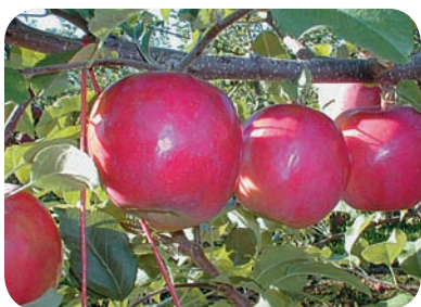
September Wonder® Fuji

This variety shows more intense red color that covers a greater portion of the fruit than standard Jonagold. It colors much more uniformly throughout the tree. It matures one week ahead of standard Jonagold, and is one size smaller than other Jonagold strains (a plus). It is less susceptible to sunburn. USPP#7,590.