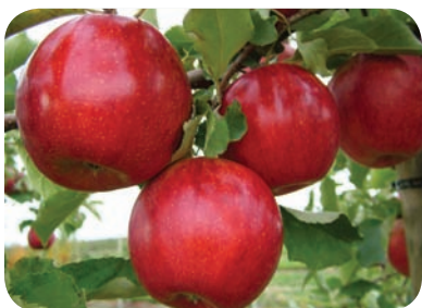
Morren's® Jonagored Supra™

Morning Mist is an early maturing Fuji sport discovered in Brewster, WA. Its bright-red finish colors better than any early Fuji we have seen to date. The flesh is creamy white with a sweet, juicy, Fuji-like flavor. Experience shows Morning Mist crops and sizes well. USPP#16,270.