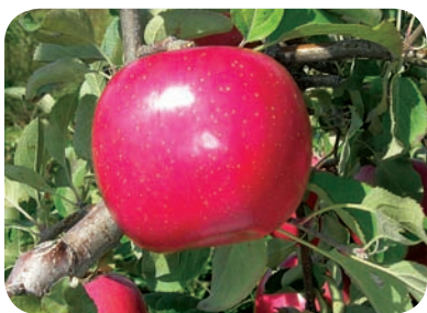
Rising Sun® Fuji

Earlystar is a Stellar Series peach ripening 18 days before Redhaven. The fruit is round with a full deep-red color and no tip. Earlystar is clinging when firm-ripe and partially free when fully ripe with excellent flavor, very minimal fibers, and few split pits. An IPM* Variety.