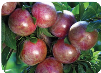
Dapple Dandy Pluot®

A Rubin x Vanda cross, Crimson Topaz is a new disease-resistant dessert apple. The fruit is medium in size, crisp, and juicy with good flavor. It has a 50% orange-red striping color over a yellow background. The growth habit is spur-like, vigorous, and upright. Crimson Topaz is a precocious cropper and the fruit does not drop. It is resistant to apple scab and moderately resistant to mildew. Topaz cltv.