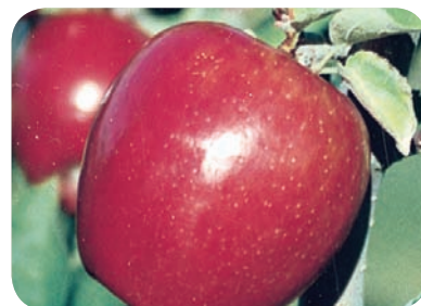
Redfield® Red Braeburn

Red Jonaprince is the Red Jonagold strain that delivers one-pick color. The deep red hue shows on all the apples at the same time, and in many cases the coloring comes earlier than on other strains of Jonagold. Red Jonaprince is an exclusive Van Well Nursery introduction. It has the large size and excellent flavor of its parent, Jonagold Prince, plus the advantage of better storage and flavor-keeping qualities. Red Jonagold cltv., USPP#11,112.