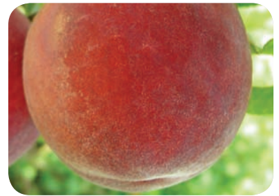
Flamin' Fury® PF-Lucky 13

A russet-resistant Golden. If russetting is a problem with your current Golden Delicious variety, try this smooth, glossy-skin Golden, which originated in our test orchard. Slightly more conical than the original Golden Delicious, but with a flavor to match. Stores better than Golden Delicious and is less susceptible to shriveling. Ripens in late Golden Delicious season. Goldensheen #2 cltv.