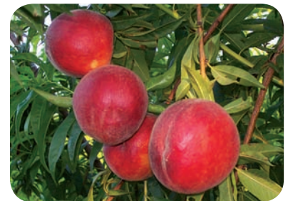
Spring Flame® 21 Cv. 'Burpeachone' (D2.102)

This is an early ripening, sub-acidic, white-fleshed nectarine with excellent size, flavor, and color. This tree is very productive. Fruit has been well received in the Orient for the past three seasons. Ripens approximately in the 21st week of the year. Commercially planted. USPP#15,192.