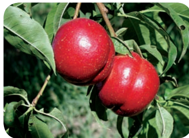
Snow Flare® 21 Cv. 'Burnectfourteen' (E7.044)

This is a high-quality peach which is large in size and very firm. It has very good flavor and has an attractive color. This peach produces relatively uniform-sized fruit throughout the tree. Approximate ripening date June 18-25. Commercially planted. USPP#13,392.