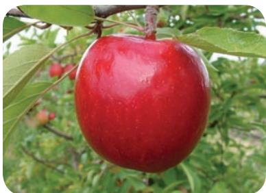
Eve® Braeburn Mariri Red cltv.

Cameo has a sweet, tart flavor and a crisp, juicy texture. The apple stores and handles well, while the tree has growing characteristics similar to Golden. This precocious variety is harvested in early to mid October. Caudle cltv., USPP#9,068.