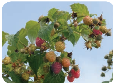
Himbo Top™ Rafzaqu variety

Anne is the largest, best-tasting yellow raspberry. It is a large-fruited fall bearer that ripens at the same time as Heritage. Fruit holds a pale yellow color and is proving to be highly productive. Anne's excellent size, appearance, and very sweet flavor make it an excellent choice for a yellow fall bearer. Anne can be pruned for summer production or mowed for fall production. Best in zones 4-8. USPP#10,411.