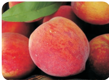
Flamin' Fury® PF-5B

A superior early yellow apple. Smooth skin is occasionally blushed on exposed areas. Sweet, crunchy, non-browning flesh resists bruising, making it a good shipper. Ideal for U-Pick operations as it holds two to three weeks on the tree. Excellent shelflife and holds several months in common storage. Ripens three to five days ahead of Gala. McLaughlin cltv., USPP#19,007.