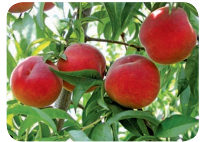
July Flame® Cv. 'Burpeachfive' (B2.098)

This is a new, early ripening, and white-fleshed nectarine for commercial use. Burnectwentytwo has firm, non-melting clingstone flesh that is very sweet and sub-acid in flavor. The skin is 90% red blush over a creamy white background. The fruit is harvested between May 25 and June 4 and has exhibited excellent shipping qualities, making it a favorite early season white nectarine. USPP#18,293.