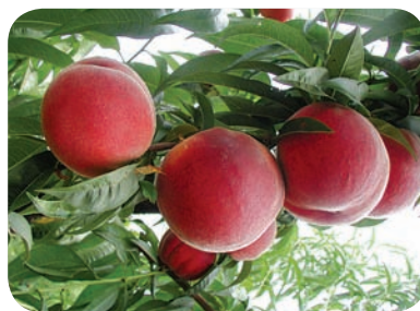
Summer Flare® 27 Cv. 'Burnectfifteen' (E4.050)

This peach has excellent firmness and size. Color is rich red, and the fruit is very nicely shaped and uniform. It has very good flavor and conditions well. It ripens approximately in the 22nd week of the year. Commercially planted. USPP#15,263.