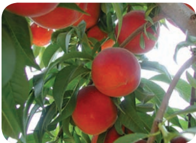
June Flame® Cv. 'Burpeachsix' (B4.098)

This is a very firm peach with outstanding flavor. It is highly colored with good shape and ripens approximately seven days before Elegant Lady. Commercially planted. USPP#12,505.