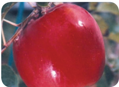
Auvil Early Fuji®

One of the first early maturing Red Fuji sports, this proven strain matures about six full weeks ahead of other Red Fuji selections yet produces a higher percentage of Washington Extra Fancy fruit. When famed Washington orchardist Grady Auvil discovered this new Fuji sport, he predicted "it will revolutionize the Fuji market." Its fruit flavor, tree structure, and growth habits appear to be identical to other Red Fuji selections. Fuji 216 cltv., USPP#10,141.