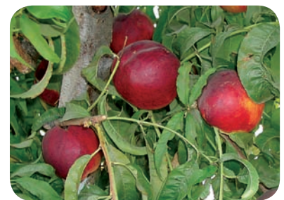
Summer Flare® 31 (E25.071)

This is a very large yellow-fleshed clingstone nectarine. It has very good flavor, and eats well. This nectarine is very productive and produces relatively uniform-sized fruit throughout the tree. This nectarine has non-melting flesh, which is ideal for storage. Approximate ripening date is July 5-10. Commercially planted. USPP#15,622.