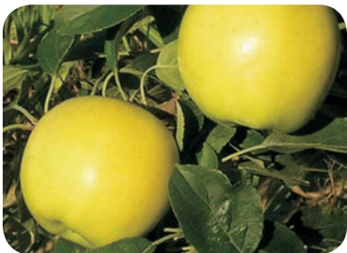
Blondee™ Apple - NEW!

Firm flesh and excellent flavor. In our 2008 test block this freestone peach variety was one of the best in its time of ripening. Tree is productive and spreading with good resistance to bacterial spot. USPP#14,384.