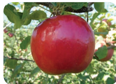
Morning Mist™ Fuji

Introduced in 1991, Honeycrisp is creating quite an interest with commercial growers. The well-balanced, sub-acid flavor combined with a crisp, juicy texture make for an enjoyable eating experience. Harvest is mid-late September or about one week after McIntosh. Bred specifically for winter hardiness, the tree is low in vigor with average fruiting precocity. USPP#7,197.