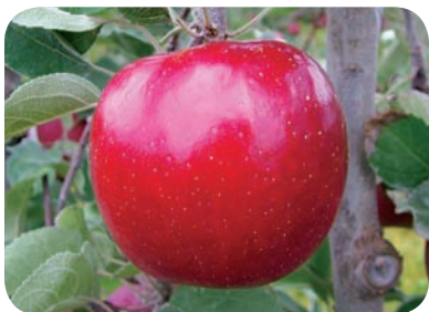
Aztec Fuji™ DT2 variety

This exciting new, high-colored Fuji comes to us from the land down under. Discovered in New Zealand, Aztec Fuji has the sweet, juicy, crisp texture and harvest maturity of standard Fuji. Aztec is a blush-type Fuji and early observations show it to be the highest-coloring sport we have seen to date. Aztec Fuji is a protected trademark of Waimea Variety Management Ltd.