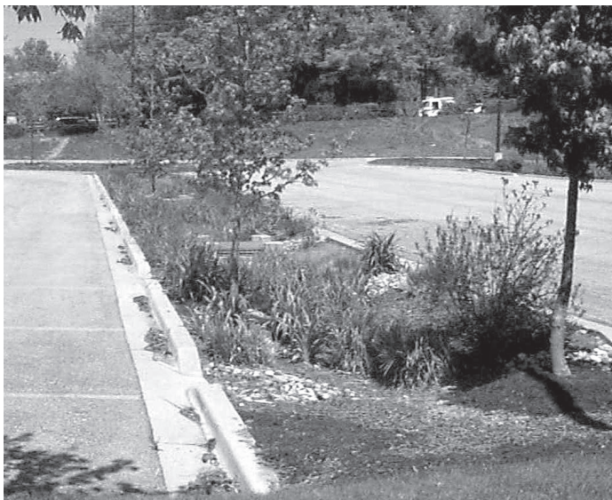
Figure 3. Photo of parking lot with established landscape islands for infiltration of runoff.

be shade tolerant and, if winter salting is the norm, salt tolerant. Shrubs and perennials must be attractive at close range; weedy growth or sprawling habit can make the landscape appear unkempt. Evergreen leaves and showy flowers are a bonus. Maintenance for bioretention landscape islands is not much different from that required for a standard landscape island: annual testing of soil pH, mulching, inspection of plants for pests, pruning for shape and vigor, and regular litter removal. The specification of flood-tolerant woody and herbaceous perennial plants will ensure that any intermittent flooding is a benefit rather than a threat to plant health. Balanced combinations of both