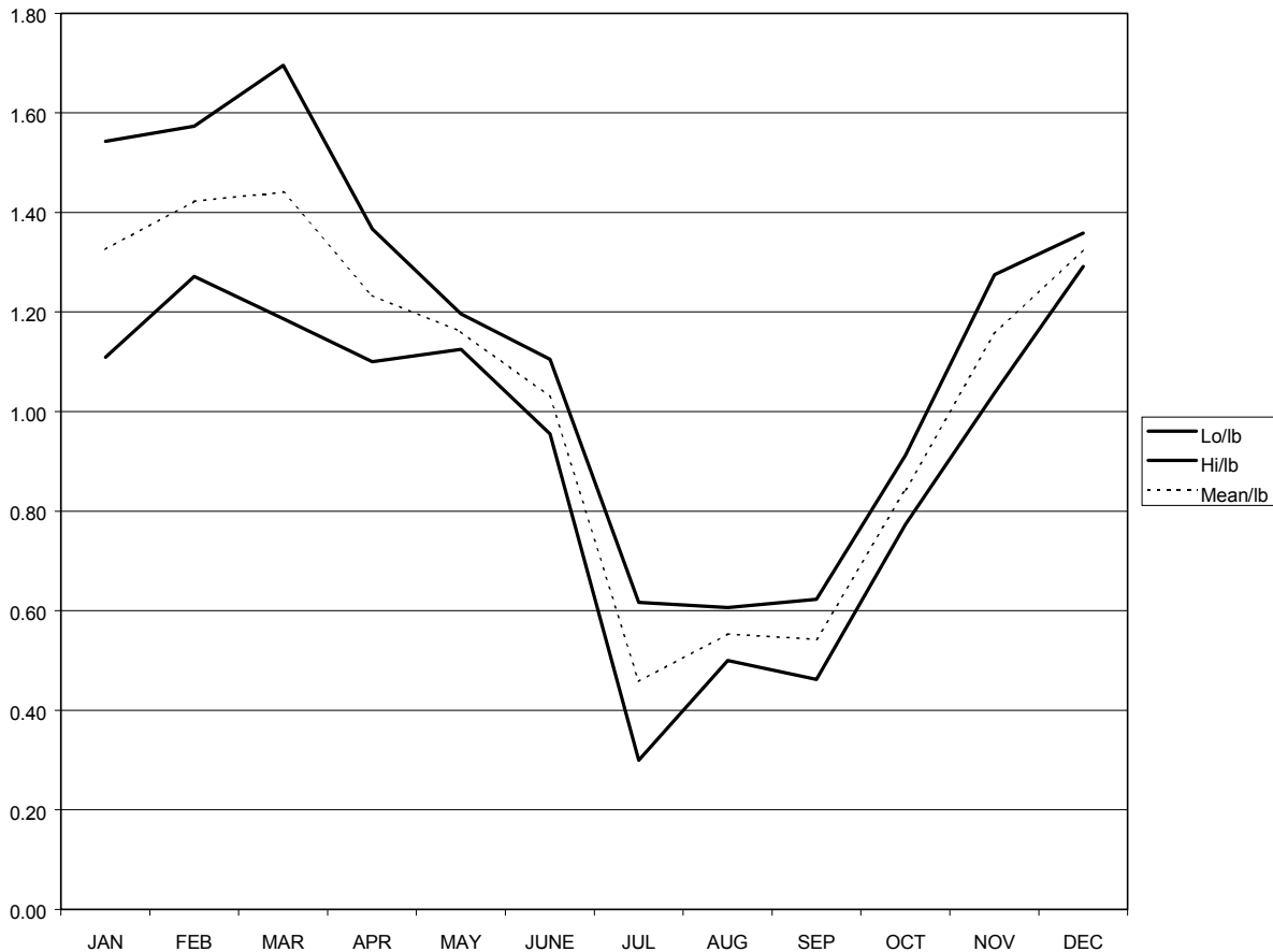
Figure 1. 1997 Seasonal Price Variation, Organic Fresh-Market Tomatoes*

In general, the tomato market fluctuates with the growing season, starting high and dropping as the summer season progresses. That is why plasticulture and hoop house production — techniques which increase earliness or extend the season — have become popular.