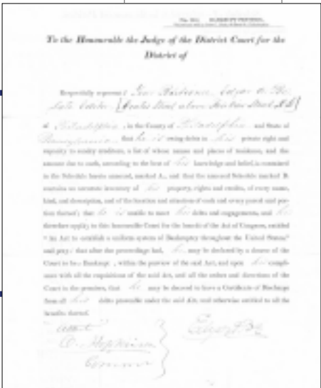
Edgar Allan Poe Bankruptcy Court Records NARA Mid-Atlantic Region, Philadelphia

NARA's Northeast Region Pittsfield 413-236-3600 pittsfield.archives@nara.gov