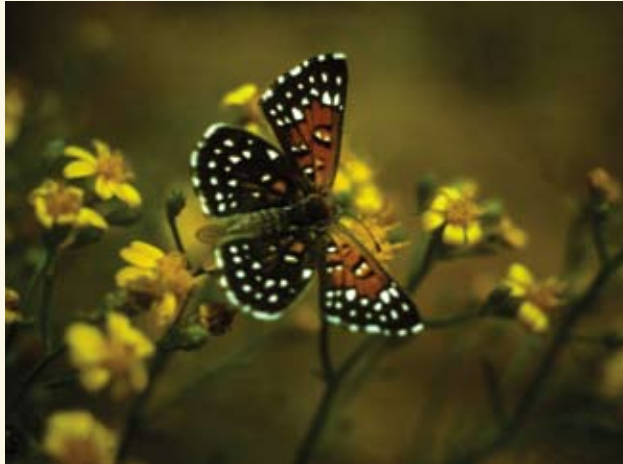
Faced with the possible loss of Lange's metalmark butterflies – down to just 45 adults in 2006 – Antioch Dunes National Wildlife Refuge in California launched an aggressive habitat conservation project and a special breeding program with Moorpark College. (Jerry Powell)

The U.S. Fish and Wildlife Service launched an aggressive effort to restore habitat at Antioch Dunes Refuge, even as it also sought to breed the species in captivity until its wild population can be stabilized. The number of Lange's metalmark butterflies in the wild has plummeted from a peak of 2,342 in 1999 to just 45 adult butterflies in 2006. Counts are conducted weekly on the refuge during adult emergence period, from July through September each year.