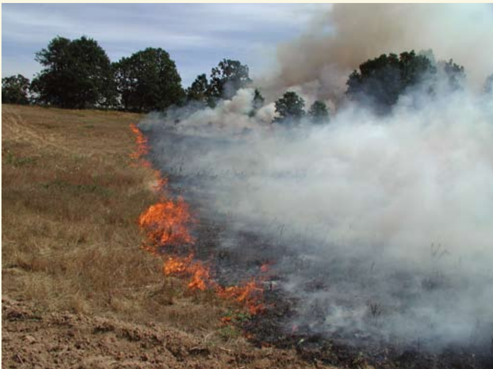
Specialists from two national wildlife refuges in Iowa are trainers in a program designed to equip volunteer fire departments with the skills needed to conduct prescribed fires.

For more information on the Iowa training program, contact Gregg Pattison at 641-784-5356 or Gregg_Pattison@fws.gov .