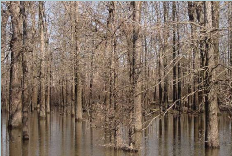
In Arkansas, Felsenthal National Wildlife Refuge is using "flexible management" to ensure the health of its green tree reservoir.

In the fall of 2007, Felsenthal Refuge initiated its new management regime. During the preceding 10 years, water had been brought up a full five feet to flood the entire GTR; the new flood level was three feet.