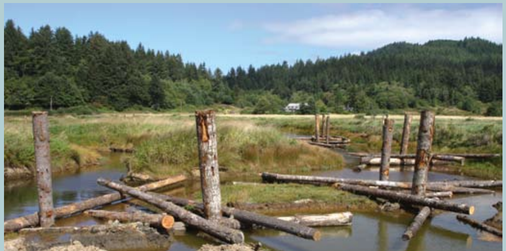
Oregon Coast National Wildlife Refuge Complex and its partners have completed a restoration of 82 acres of tidal marsh on Nestucca Bay National Wildlife Refuge that will restore the marsh’s natural functions.

The Oregon Department of Fish and Wildlife assisted with design and