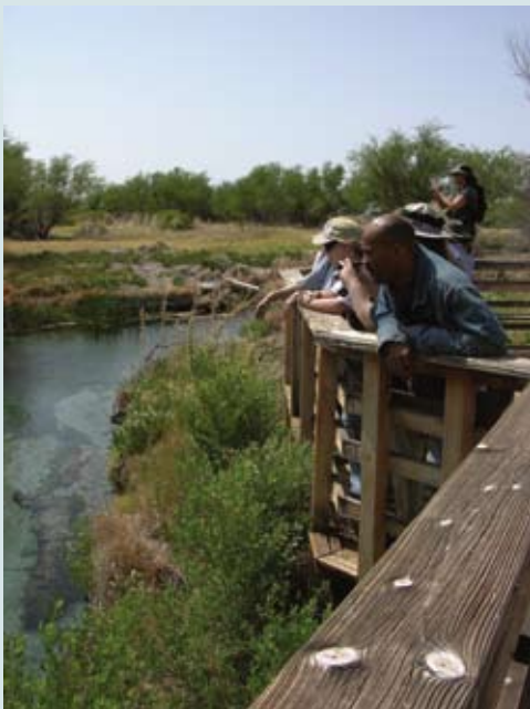
Not too far from the bright lights of Las Vegas, an extraordinarily tranquil oasis of wetlands fed by ancient warm springs – Ash Meadows National Wildlife Refuge – is in the midst of an extensive restoration project.

With its rich and complex variety of habitats, the refuge – only 90 miles from