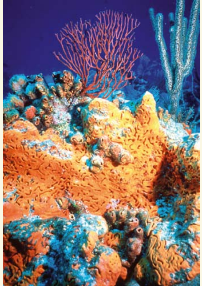
On November 15, on the southernmost tip of Florida, tourists and residents alike will join in a day of festivities marking the 100 th anniversary of Key West National Wildlife Refuge.

Key West Refuge provides critical nesting, foraging and roosting habitat for more than 250 species of migratory birds. The refuge also protects critical nesting