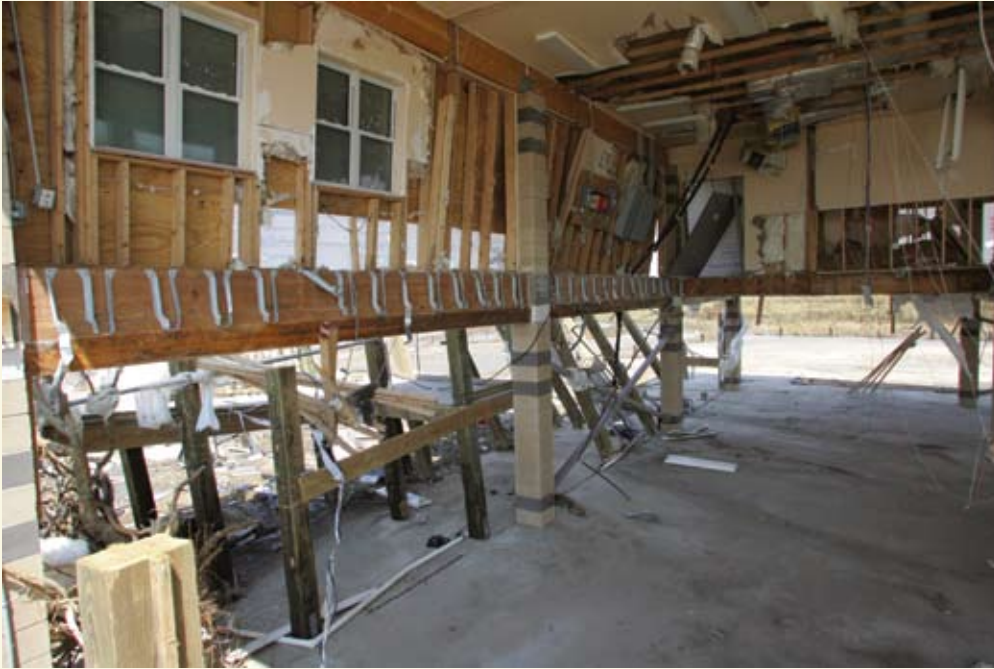
Texas Chenier Plains National Refuge Complex caught the full force of Hurricane Ike. The mid-September tropical storm impacted every standing structure on the complex, which at one point was covered with more than ten feet of sea water.

R ebuilding programs are in the works at coastal refuges – prized for the habitat they provide wintering waterfowl and other wildlife – in Texas and Louisiana that were heavily damaged in mid-September by Hurricane Ike.