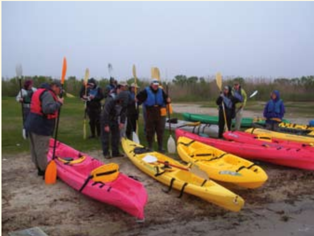
Edwin B. Forsythe National Wildlife Refuge and The Richard Stockton College of New Jersey are collaborating to train Volunteer Master Naturalists (VMN) and Certified Interpretive Guides.

A new partnership between Edwin B. Forsythe National Wildlife Refuge and The Richard Stockton College of New Jersey combines training for Volunteer Master Naturalists (VMN) and Certified Interpretive Guides (CIG) as well as continuing education credits for teachers all in a single program. The first class of 21 graduated in May and included ten refuge Friends and volunteers, several retirees and four active public school teachers. It is believed to be the first time a refuge has initiated a Master Naturalist program before a state chapter has been established.