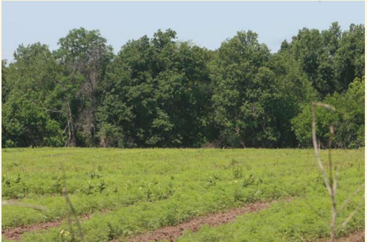
As part of The Conservation Fund's Go Zero program, Marais des Cygnes National Wildlife Refuge in Kansas is turning 775 acres of retired farmland into a hardwood forest.

The refuge also celebrated the inclusion of the Great Marsh, the largest contiguous salt marsh north of Long Island Sound (of which the refuge protects about 3,000 acres), as a WHSRN site of regional importance. The Great Marsh, which is used by more than 67,000 shorebirds of varying species and other wildlife, is vital as migratory habitat. The refuge, along with partners Mass Audubon, the Trustees of Reservations, Essex County Greenbelt Association and the Parker River Clean Water Association,