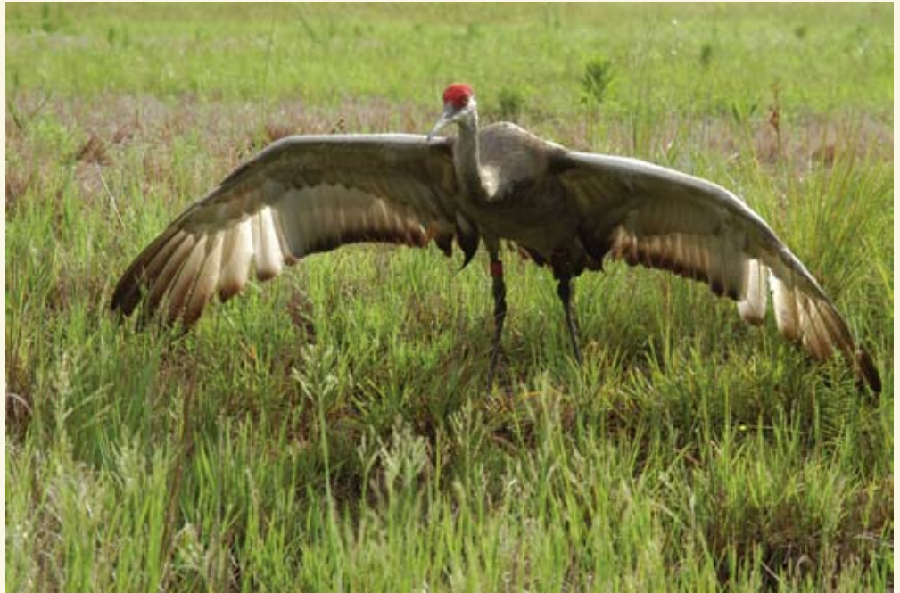
In a major advance in an on-going drive to enlarge the population of endangered Mississippi sandhill cranes, a chick has been conceived with frozen sperm.

At the Audubon Institute, cranes are reared both by parents and by puppets. The young cranes see costumed workers as grey blobs, fixating on puppets that