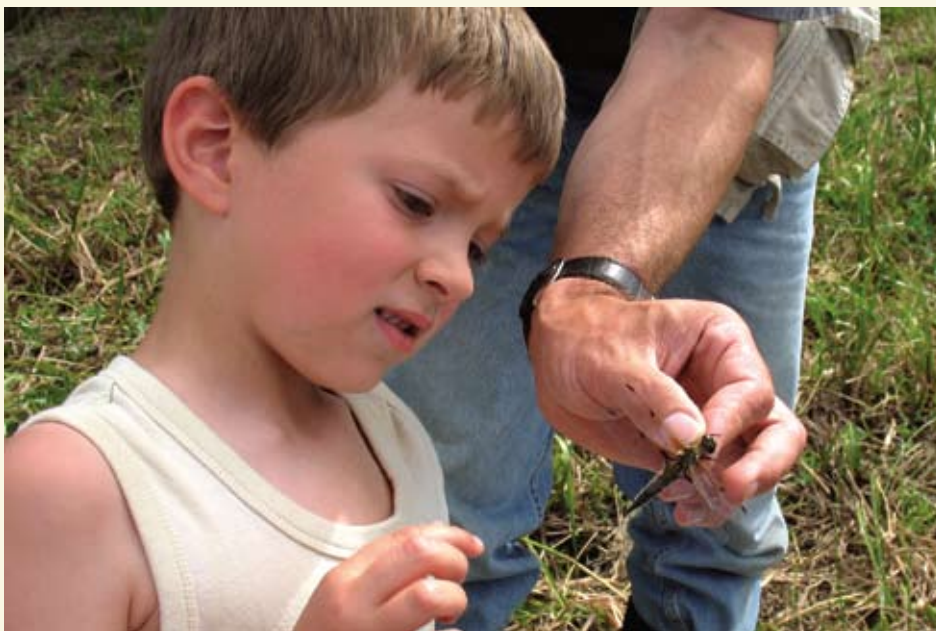
Dragonflies can be caught, carefully handled and released unharmed, providing this unique close-up view at Kanuti National Wildlife Refuge in Alaska.