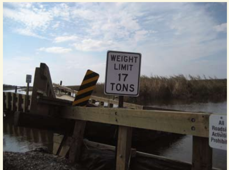
The storm also rolled over Southwest Louisiana Wildlife Refuge Complex. At Sabine Refuge, recreational facilities and bridges damaged by Hurricane Rita in 2005 and subsequently rebuilt were destroyed anew.

Contractors and engineers were quickly on the scene to assess damages and prepare estimates of damage-repair costs. Cleaning up Sabine Refuge will be complicated by the presence of containers of hazardous material and oil field debris that Ike scattered over the refuge’s 125,000 acres of wetlands. ♦