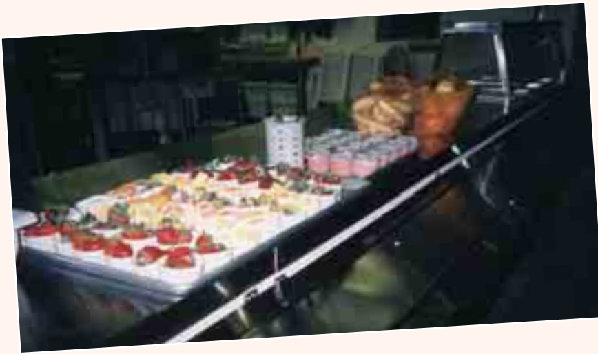
Ronan fruit and vegetable choices.

Ronan School District #30, Ronan, Montana