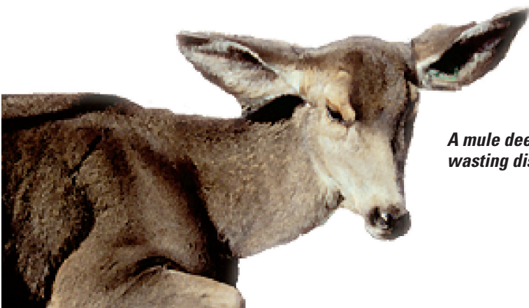
A mule deer with chronic wasting disease

The Wildlife Disease Information Node is online at http://wildlifedisease.nhii.gov/