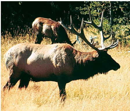
A healthy elk

In response to the discovery of CWD in new and unexpected areas, U.S. Geological Survey (USGS) scientists began collaborating with federal, state, and private partners to address the challenges of this disease. Critical needs included establishing new diagnostic capabilities, analyzing, modeling, and predicting the disease's effects, all while coordinating and distributing reliable information from a variety of resources. However, more knowledge about this disease is needed.